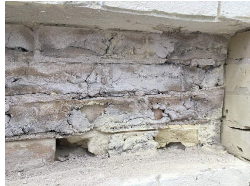
Test Cut showing Mortar between Wythes