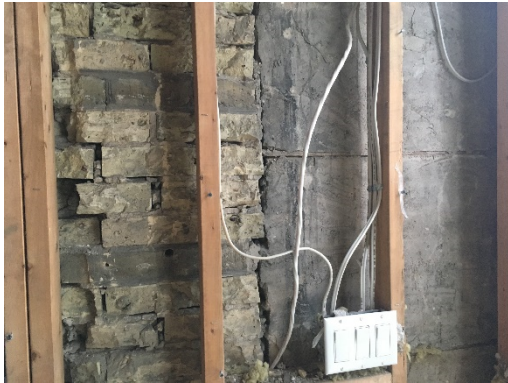
Interior Face of Masonry Wall