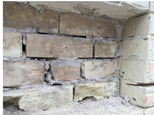
Test Cut showing Interior Brick Wythe