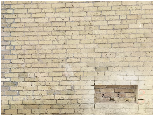
Exterior View of East Wall and Test Cut