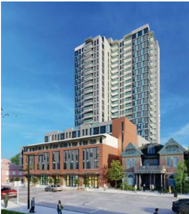
Initial (Superseded) Building Design