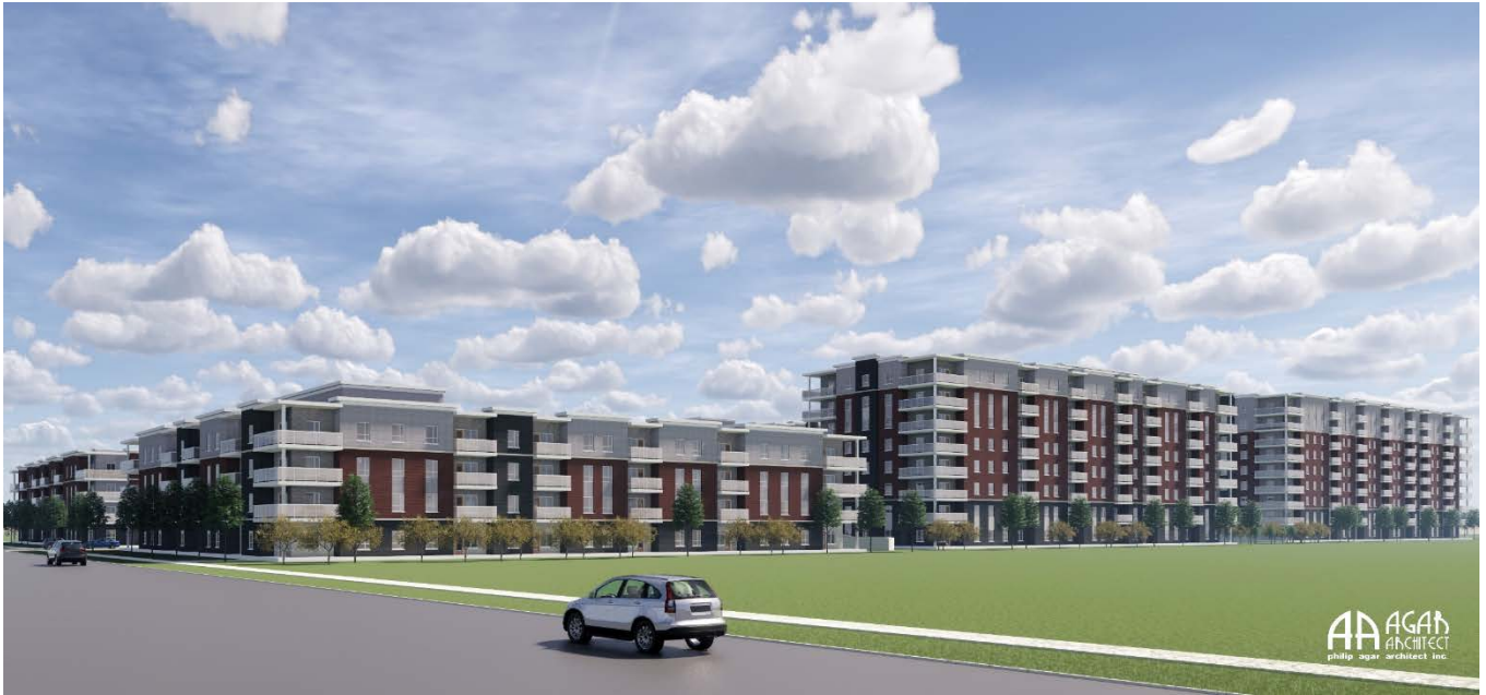
View from Southdale Road West, buildings 4, 5 & 6