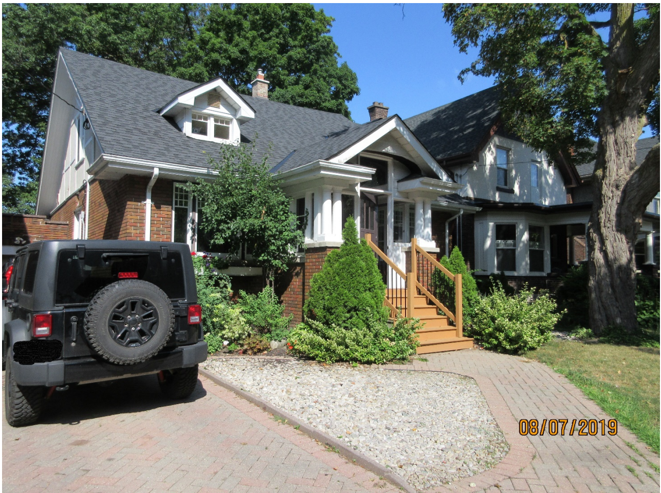
Image 2: Photograph of the property at 59 Wortley Road, showing the altered front steps.