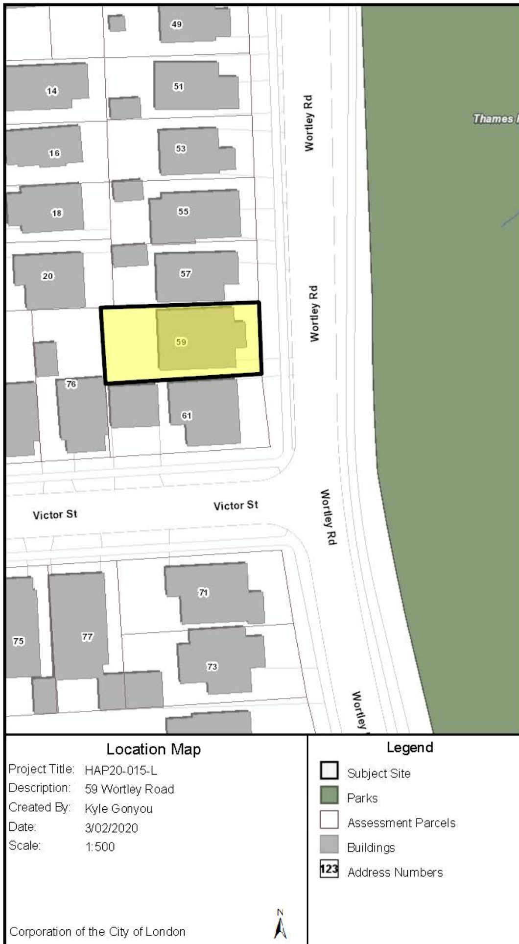
Figure 1: Location of the subject property at 59 Wortley Road in the Wortley Village-Old South Heritage Conservation District.