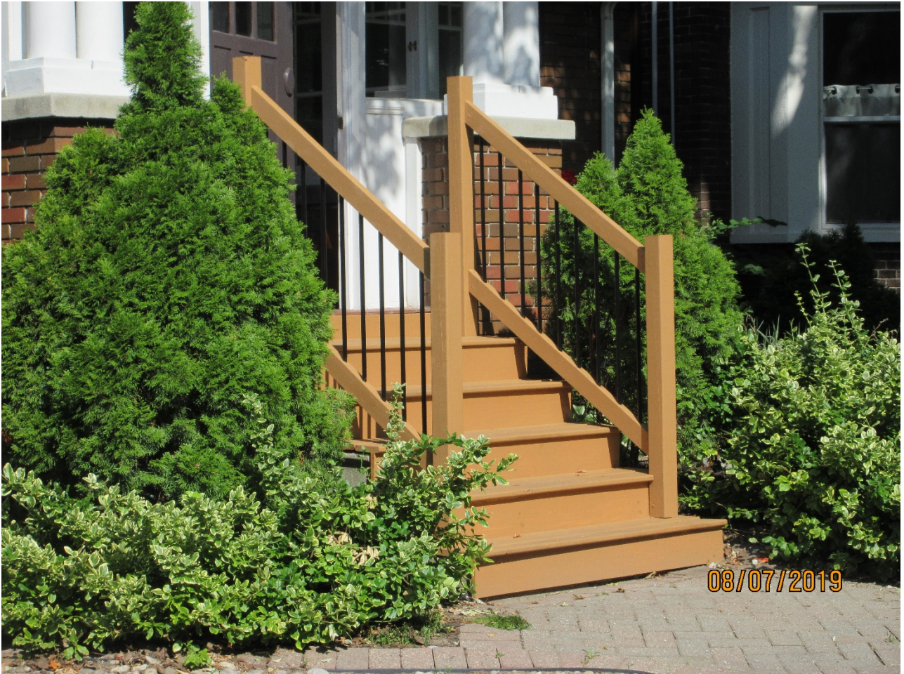
Image 3: Detail photograph of the new front steps of the property at 59 Wortley Road.