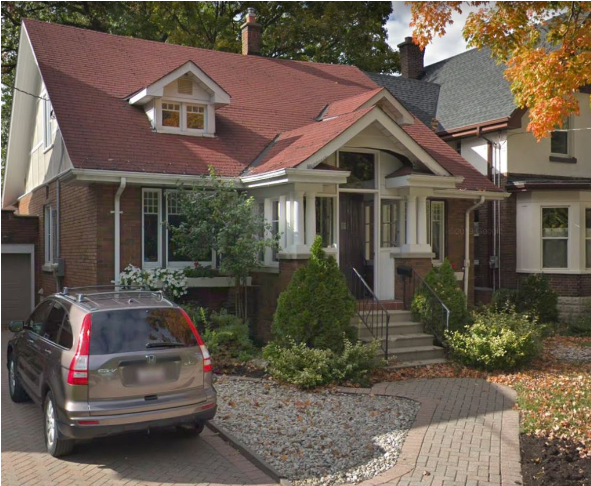
Image 1: Image of the property at 59 Wortley Road prior to alteration (October 2018).