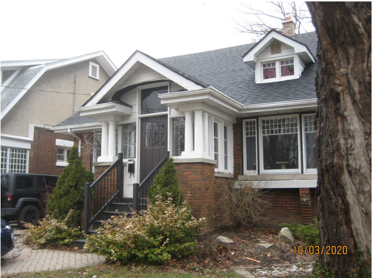
Image 4: Photograph showing the front steps of the property at 59 Wortley Road, after being painted.