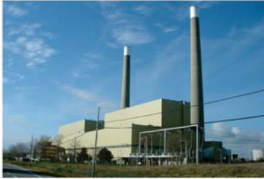
Lemnox Power Station near Bath, Ontario, Canada, November 2010.