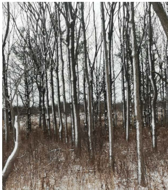
Photo showing only pine and black walnut trees planted in narrow rows

The Staff supports the request to remove the subject property from the Schedule B Tree Protection Area B-20 portion of the Tree Protection By-law.