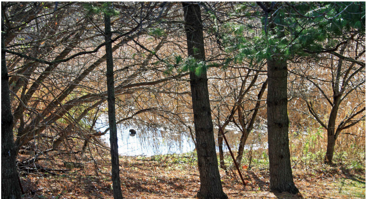
Wetland and standing water which is the source for Meadowlily Creek

This is what we'd like to see done here with regard to our environmentally significant area, its heritage resources and the neighbourhood around it: that development is possible here and that it needs to be kept in balance with the existing conditions of our area and the people and houses in it. We would welcome development that reflects and corresponds with a fair number of single dwelling units that would add to the spacious and open views and vistas of our road and green spaces. What we'd like to see is a balance struck between development, heritage features, environmental consideration and neighbourhood atmosphere. Meadowlily Woods and area is a part of the Thames River Watershed and what we do to our water and its wetlands, creeks and groundwater zones, we also do to ourselves and our children for years to come. In all of the episodes of this series a balance is struck between considerations of potential for development and respect for water, resources, community and history. We believe that Meadowlily as a whole deserves such respect and consideration. To overwhelm this space with high and medium density housing will destroy its most desirable components.