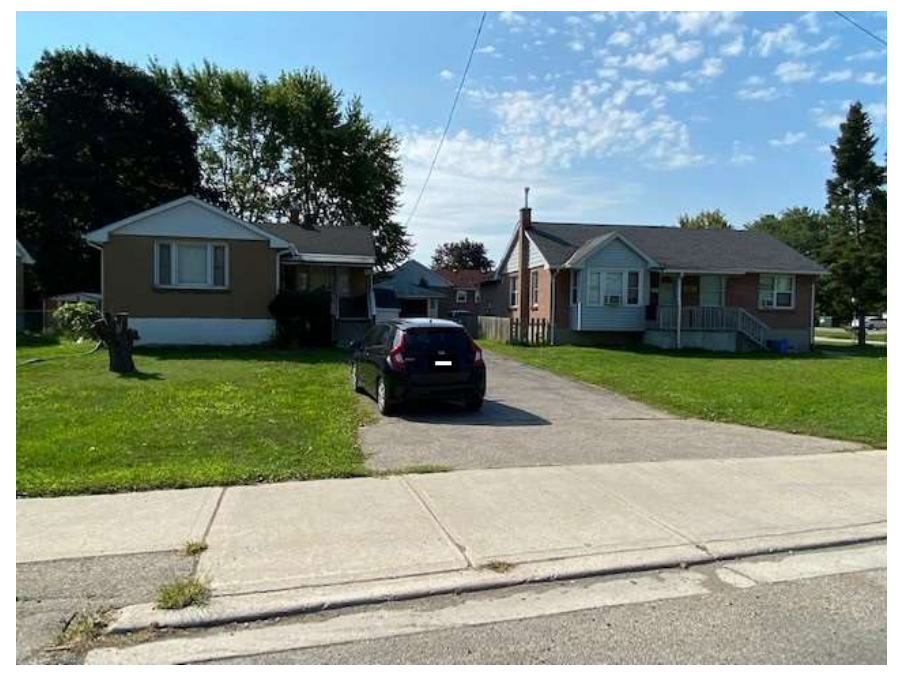
Image 5: 1455 and adjacent property at 1453 Oxford Street – street elevations (August 24, 2020)