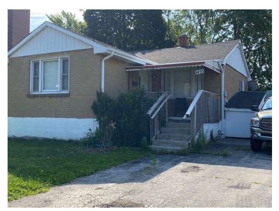
Image 1: 1455 Oxford Street East - front view of porch and entrance (August 24, 2020)