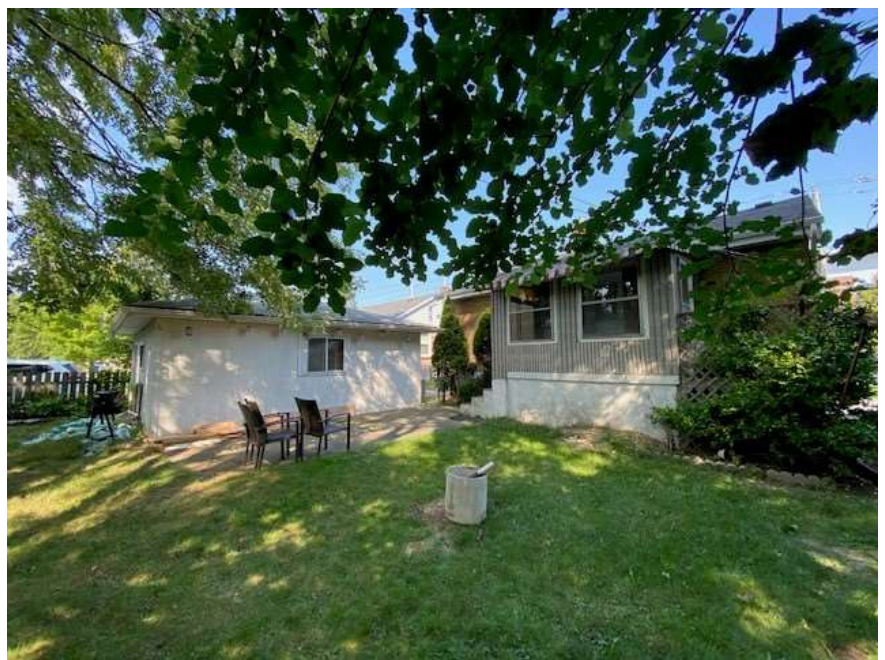
Image 3: 1455 Oxford Street East - rear view of residence, garage and yard (August 24, 2020)

Image 2: 1455 Oxford Street East – view of corner, front and east-side elevations (August 24, 2020)