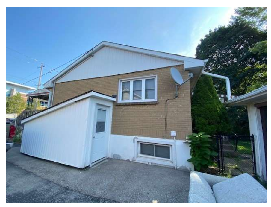
Image 4: 1455 Oxford Street East - view of east-side elevation (August 24, 2020)