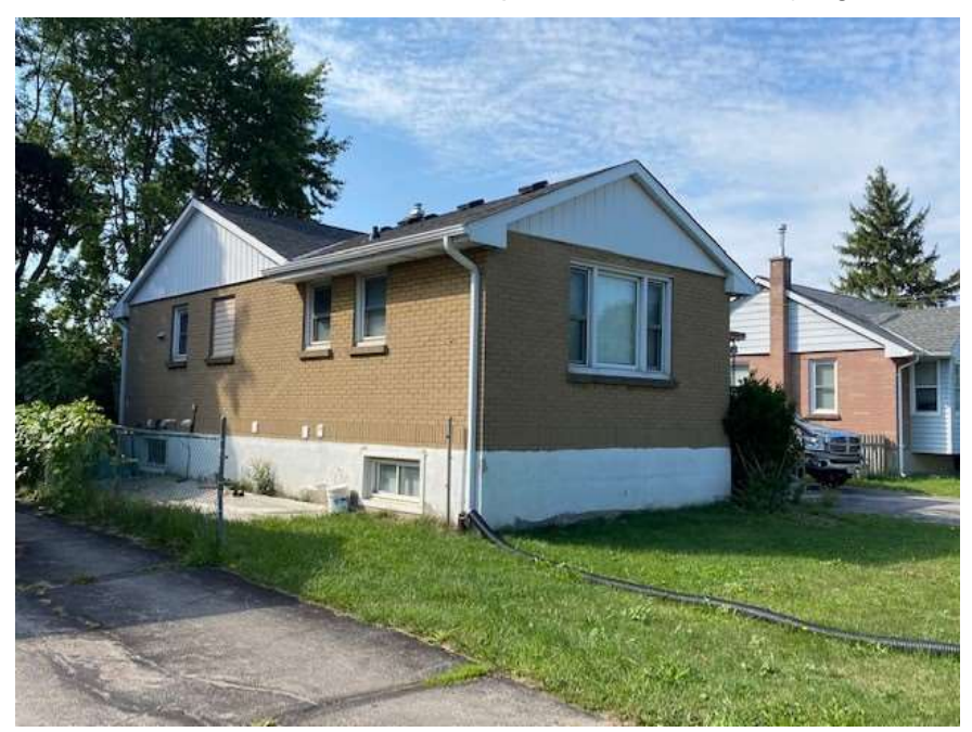
Image 2: 1455 Oxford Street East – view of corner, front and east-side elevations (August 24, 2020)

Image 1: 1455 Oxford Street East - front view of porch and entrance (August 24, 2020)