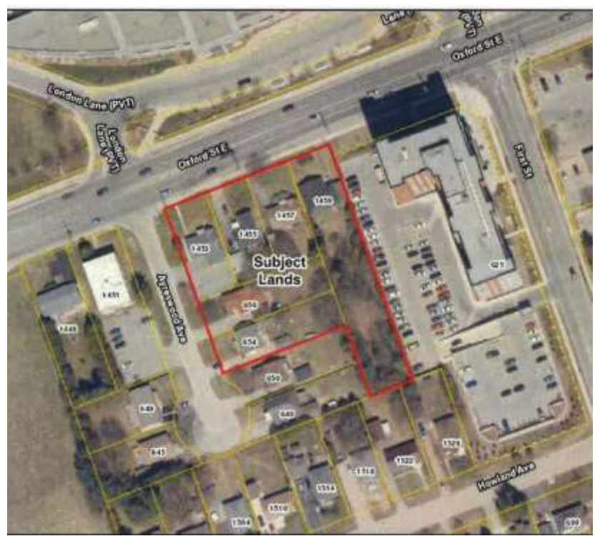
Image 6: Parcels comprising subject lands of proposed development (Zelinka, 2019)

Image 5: 1455 and adjacent property at 1453 Oxford Street – street elevations (August 24, 2020)