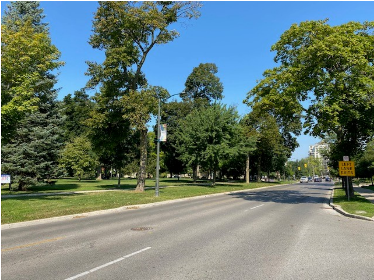
Image 5: Photograph of Victoria Park, view north along Wellington Street (August 24, 2020)