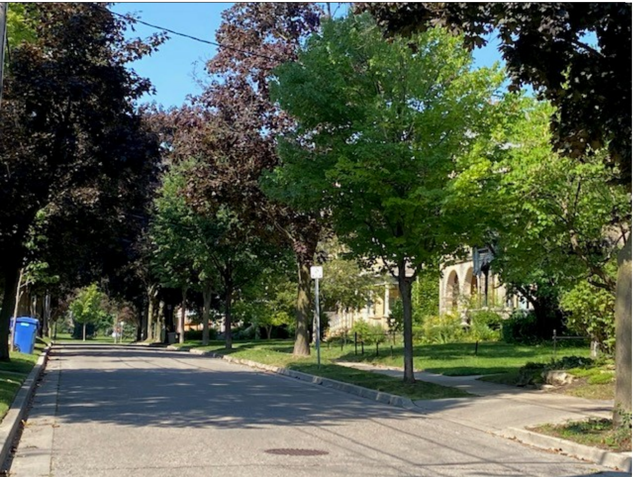
Image 14: Photograph of Wolfe Street – streetscape (August 24, 2020)