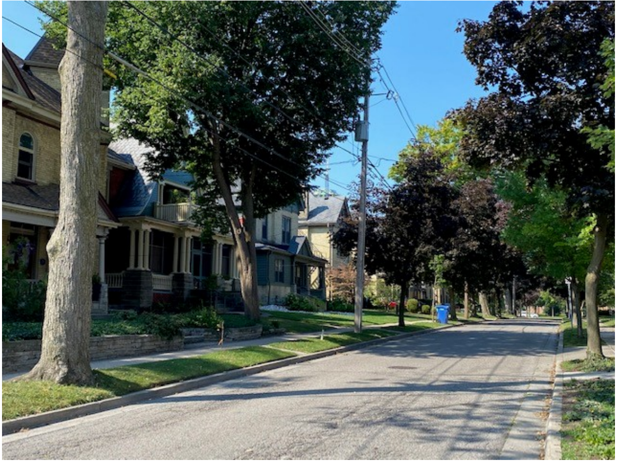
Image 13: Photograph of Wolfe Street – streetscape (August 24, 2020)