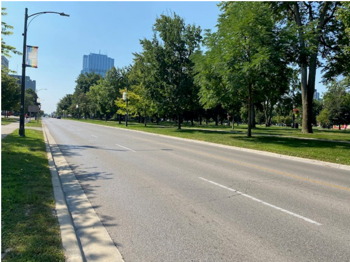
Image 7: Photograph of Victoria Park, view south along Wellington Street (August 24, 2020)