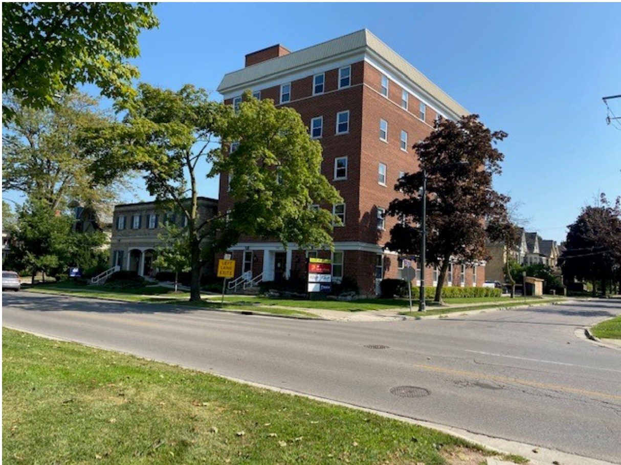
Image 10: Photograph of adjacent properties – 560 Wellington Street (August 24, 2020)