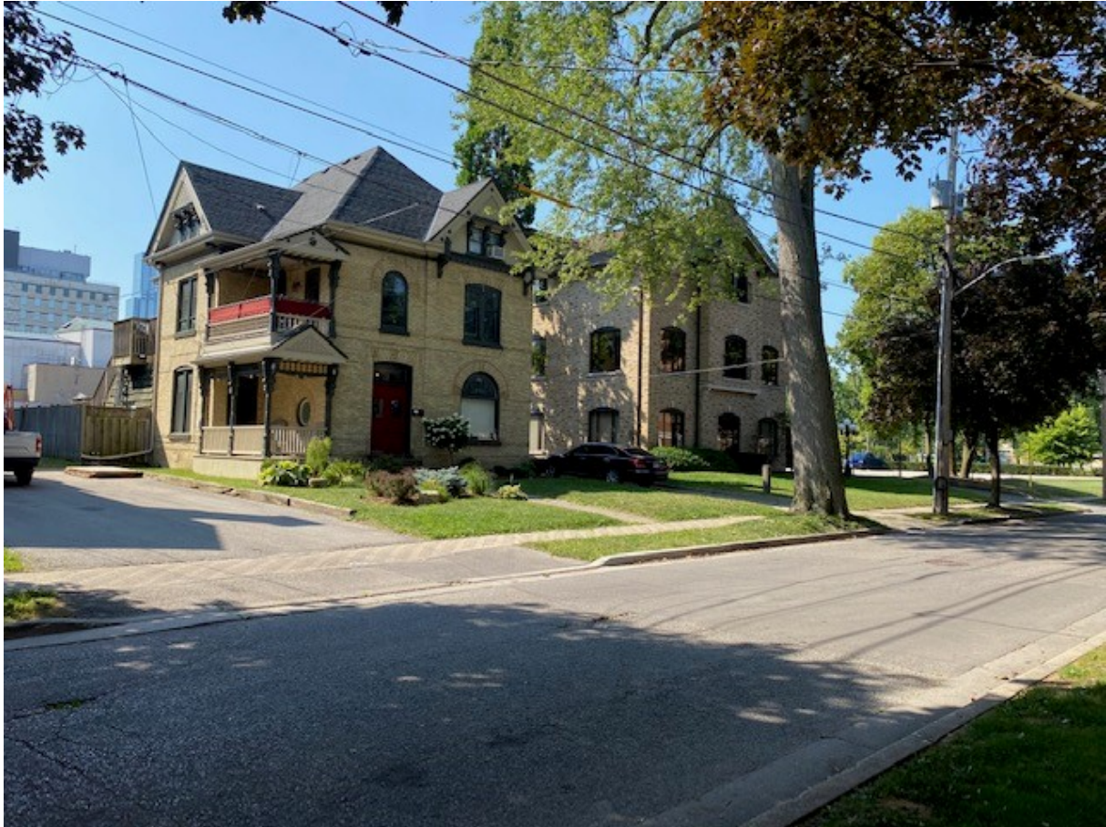
Image 9: Photograph of adjacent properties – 295 & 297 Wolfe Street (August 24, 2020)