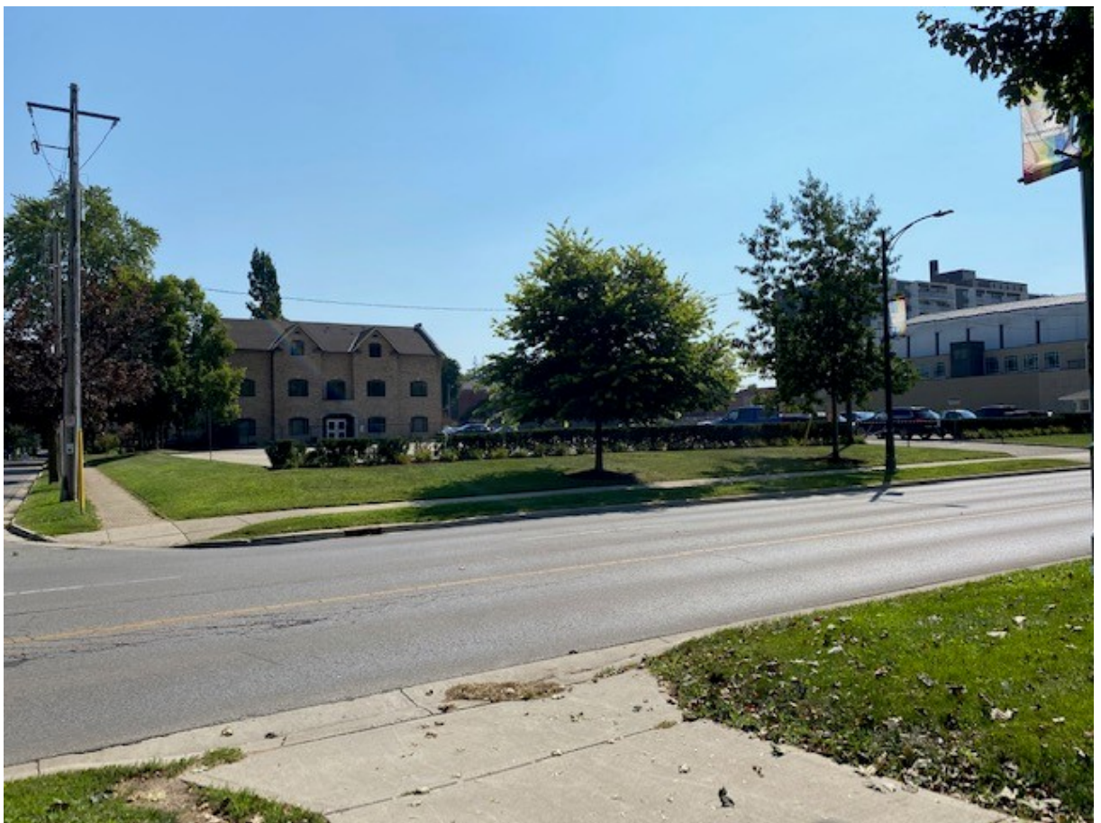
Image 2: Photograph of subject site, view south east (August 24, 2020)