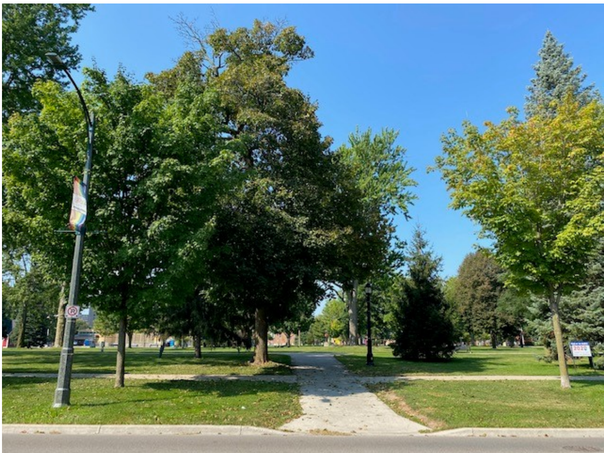
Image 6: Photograph of Victoria Park, view west from Wellington Street (August 24, 2020)