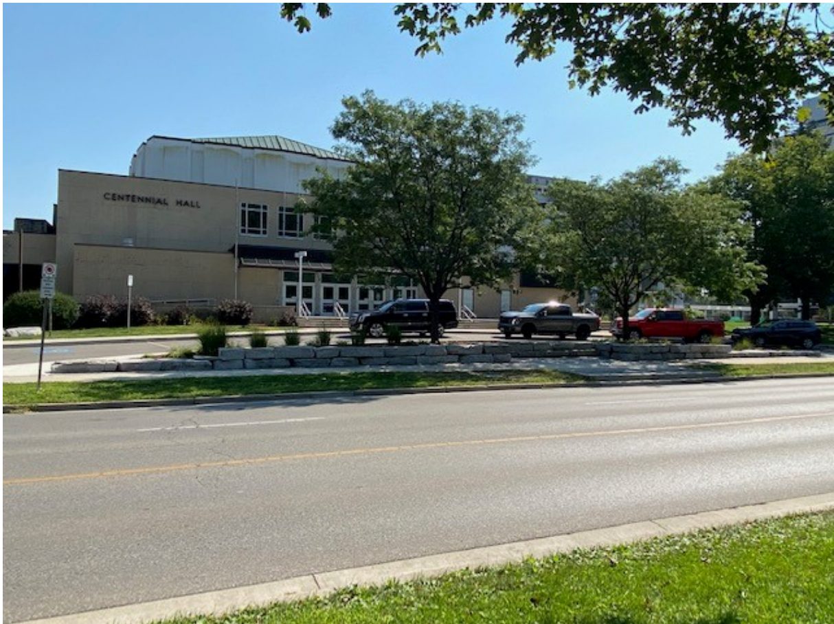
Image 8: Photograph of adjacent properties – Centennial Hall (August 24, 2020)