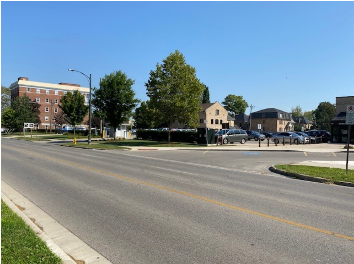
Image 4: Photograph of subject site, view north-east (August 24, 2020)