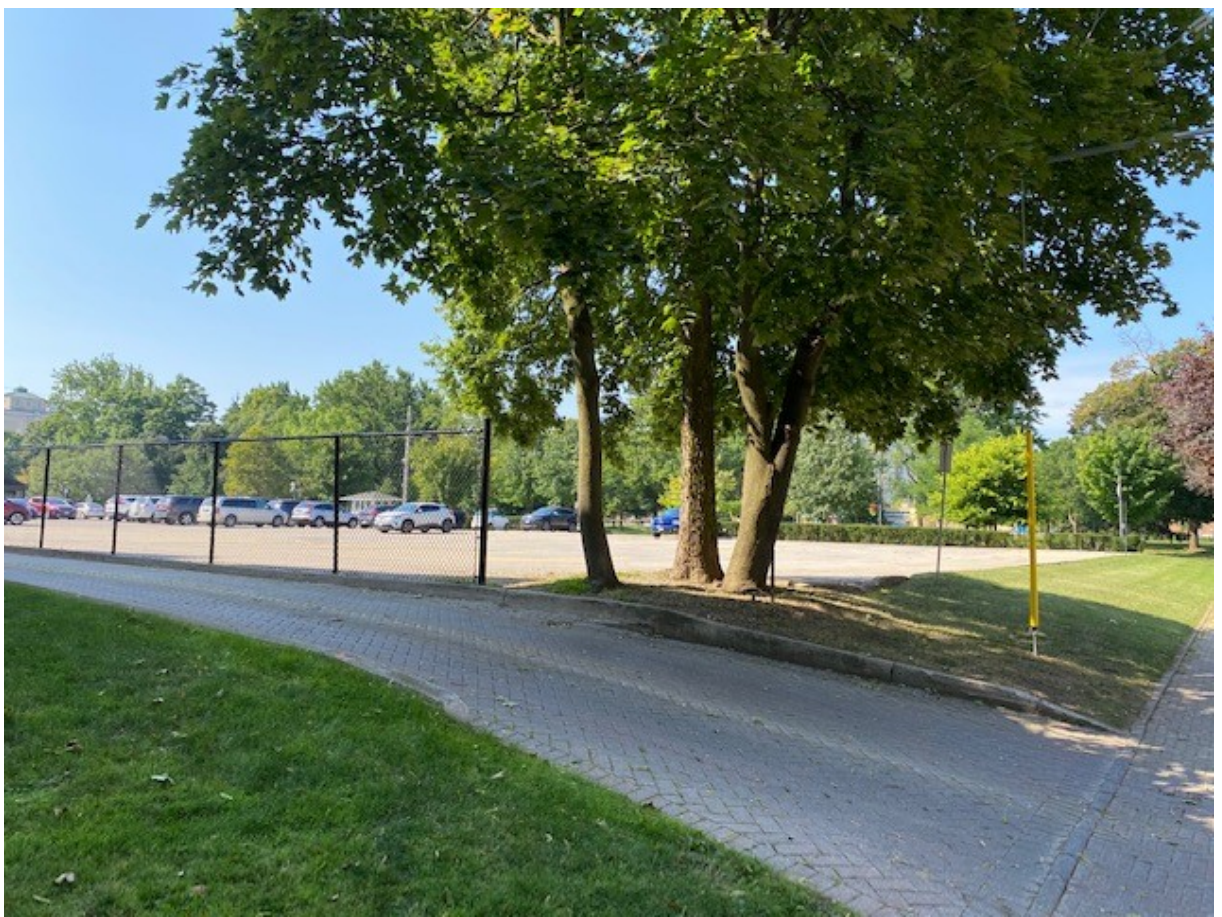
Image 1: Photograph of subject site, view south east (August 24, 2020)