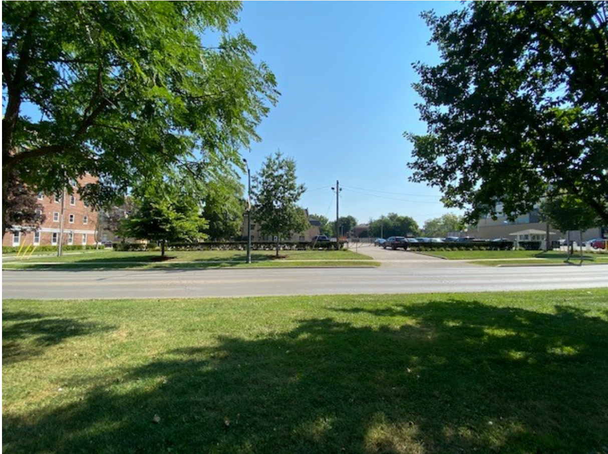
Image 3: Photograph of subject site, view to east (August 24, 2020)