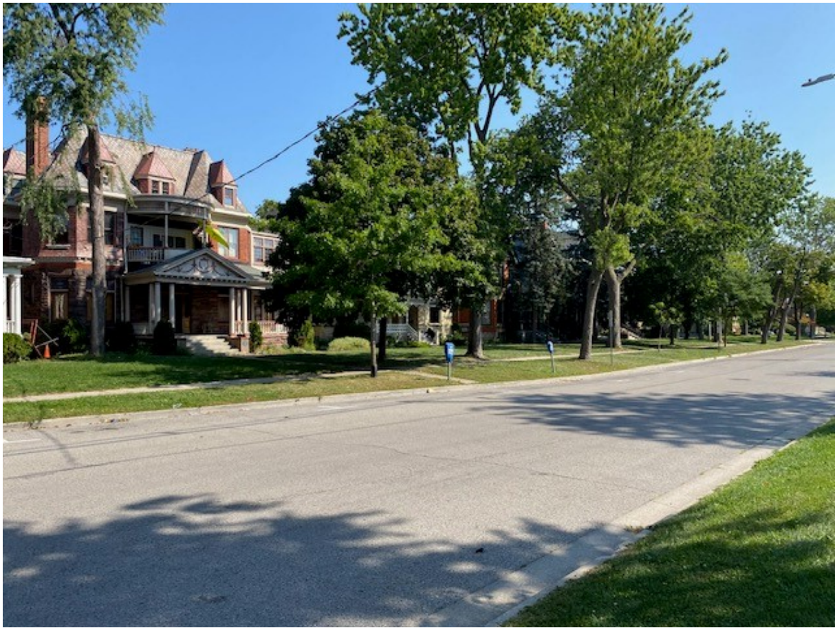
Image 12: Photograph of Princess Street – streetscape (August 24, 2020)