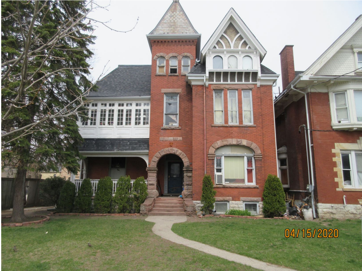
Image 11: Photograph of adjacent properties – 300 Princess Street