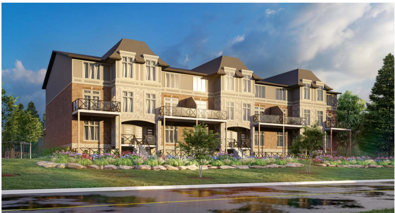
Conceptual Rendering – View from Byron Baseline Road

The above images represent the applicant’s proposal as submitted and may change.