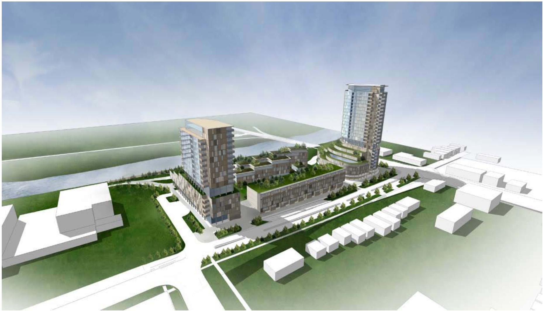
This view from the north highlights the orientation of the towers and centralized residential space along South Street.