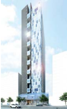
Ryerson University, Toronto