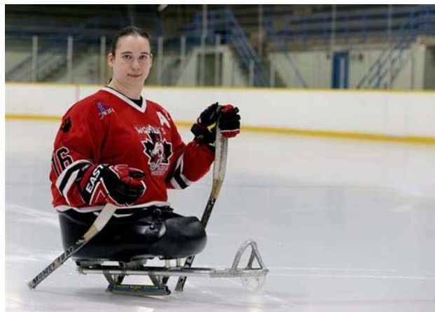
Photo Caption: This photo is of a woman in a Canadian Sledge Hockey Team jersey, seated in an ice sledge, holding 2 sledge hockey sticks. She is facing the camera with a serious expression on her face. She is holding the sledge hockey sticks with large hockey gloves.