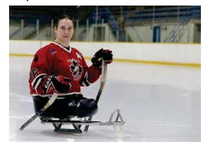
Photo Caption: This photo is of a woman in a Canadian Sledge Hockey Team jersey, seated in an ice sledge, holding 2 sledge hockey sticks. She is facing the camera with a serious expression on her face. She is holding the sledge hockey sticks with large hockey gloves.

Goal: To help make Ontario accessible for all