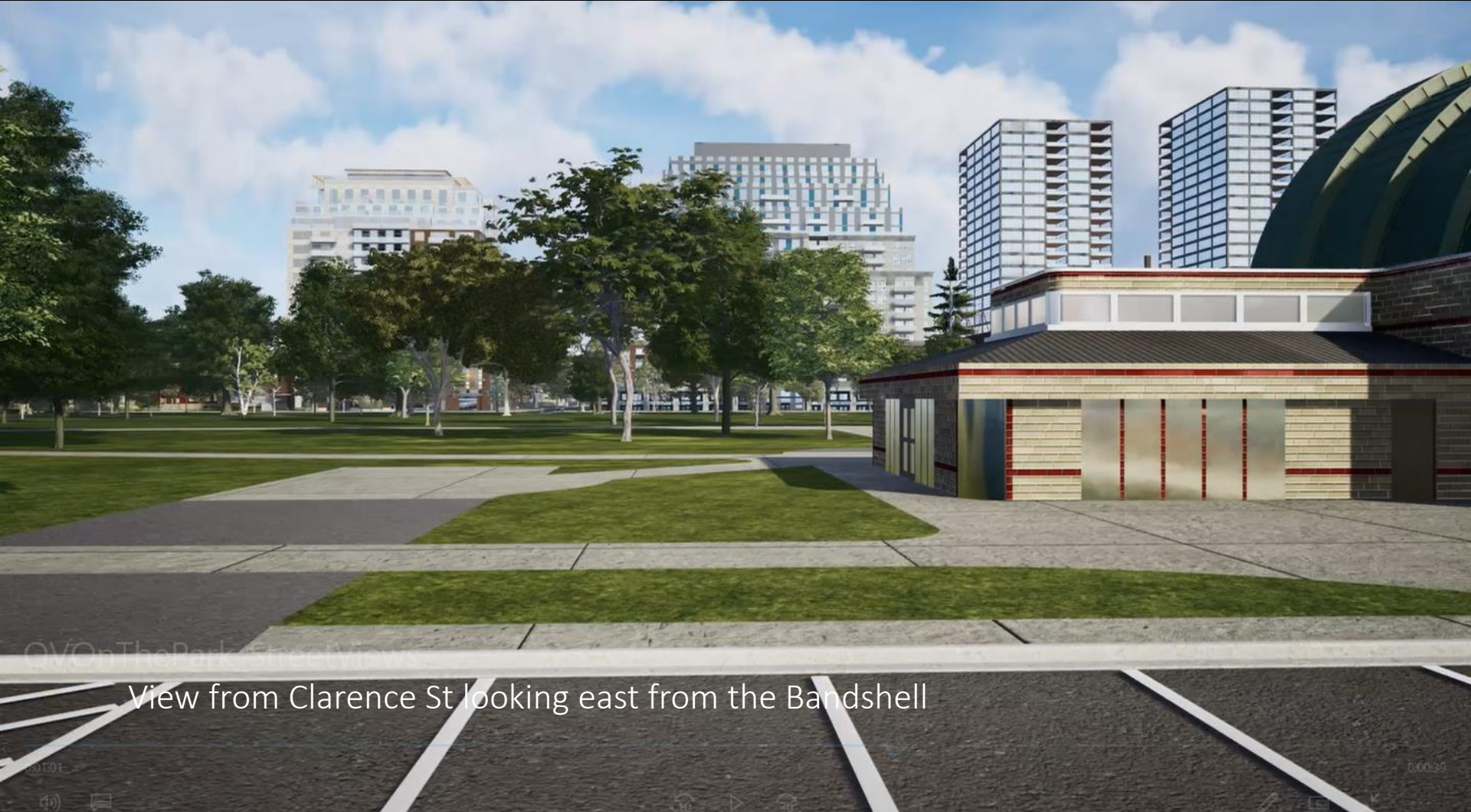
View from Clarence St looking east from the Bandshell