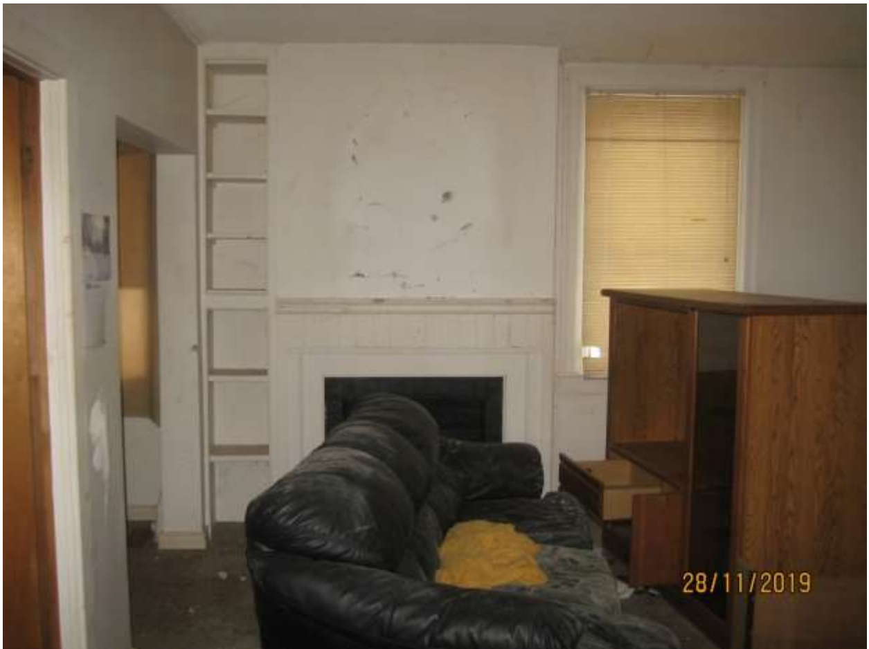
Image 12: View showing interior of the west wall, showing the location of the fireplace. Note, a chimney is no longer present on the exterior west façade of the dwelling.