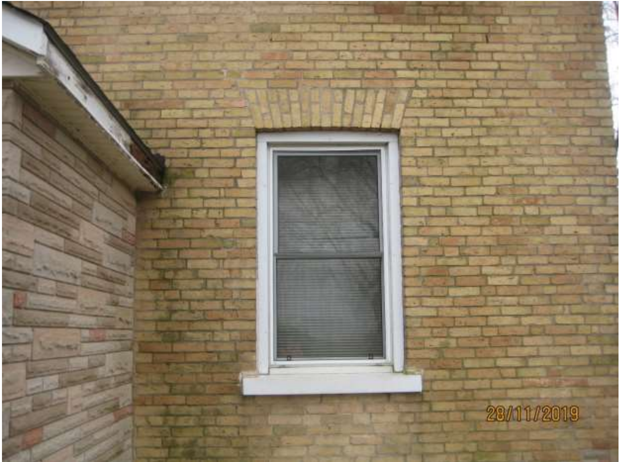
Image 7: Detail showing window on the main (north) facade. Note, several windows on the dwelling have been replaced with vinyl replacement windows.