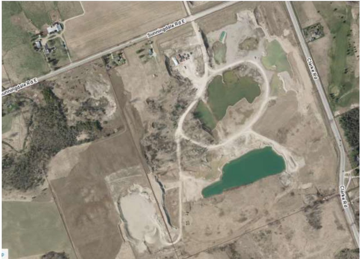
Figure 6: Aerial view showing current land use and aggregate extraction activity on the property.