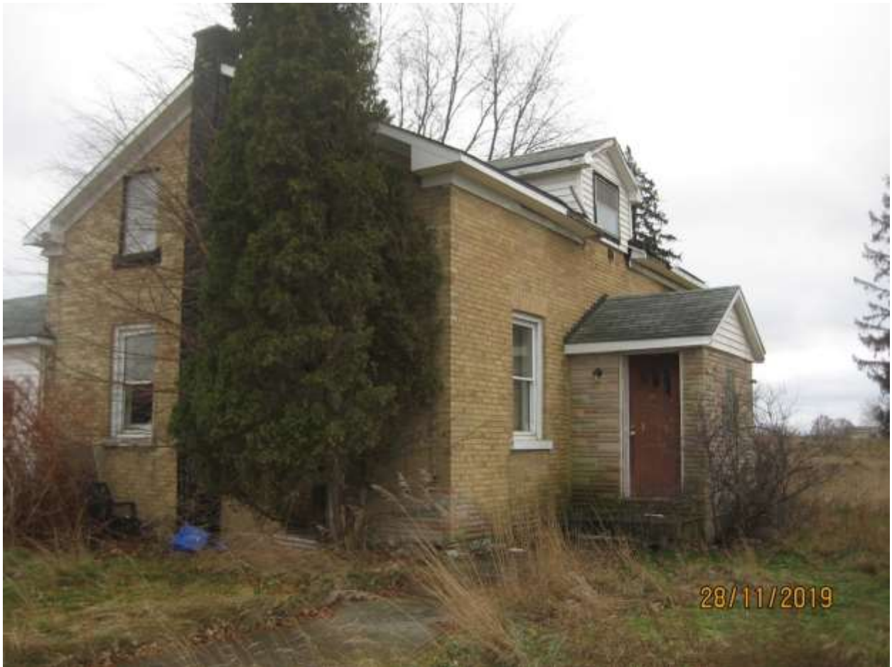
Image 9: View showing front northwest corner of the dwelling and access provided in front addition.