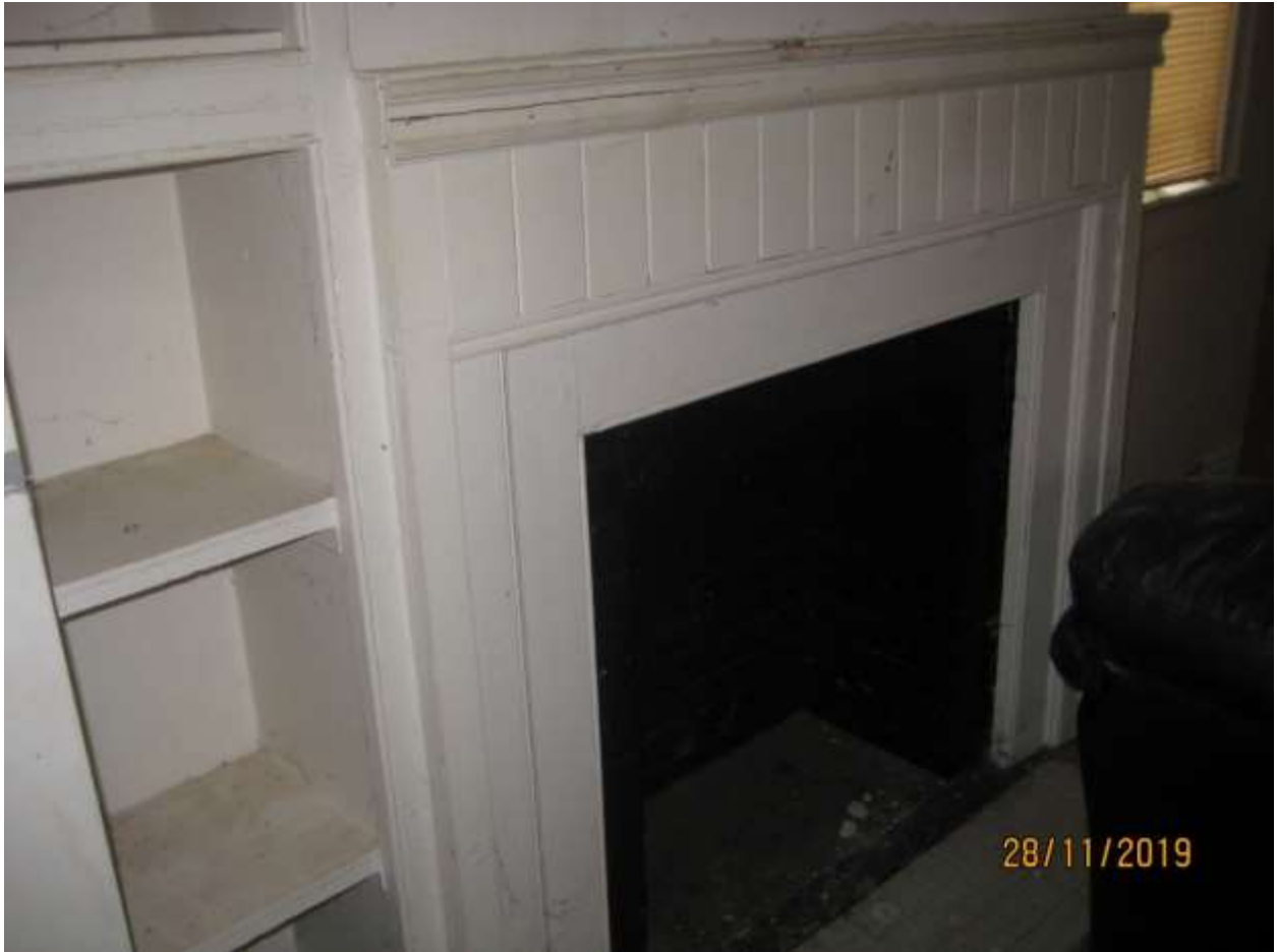
Image 13: Interior detail showing fireplace of the dwelling at 2325 Sunningdale Road East.