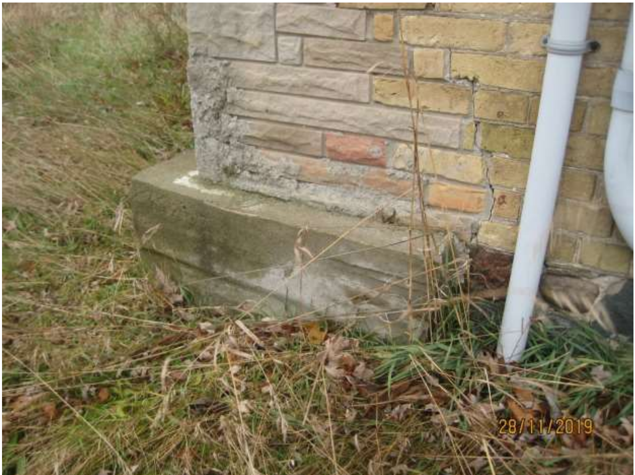
Image 10: Detail showing southeast corner of the dwelling. The north corners of the dwelling have been altered with concrete and angelstone cladding.