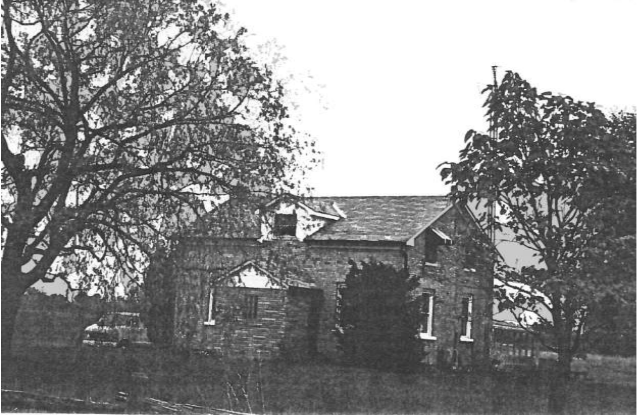
Image 1: Photograph of the dwelling at 2325 Sunningdale Road East, as shown in the 1993 City of London Inventory of Heritage Resources: Annexed Area.