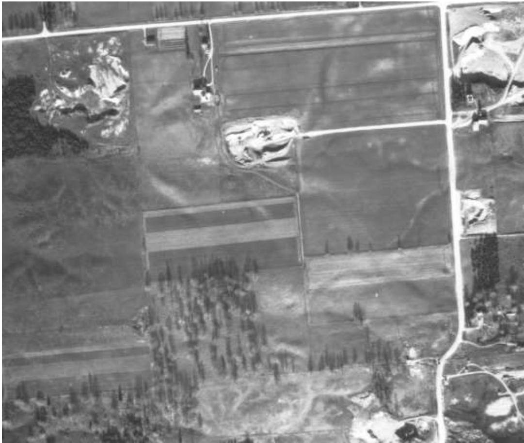
Figure 4: Extract from a 1967 aerial photograph showing the land use of the beginnings of aggregate extraction on the property