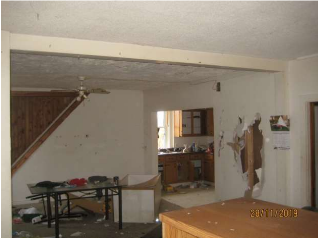
Image 11: View of the interior of the first floor. The stairs are located at the left of the photograph. The historic floor plan has been extensively altered on the interior of the dwelling.