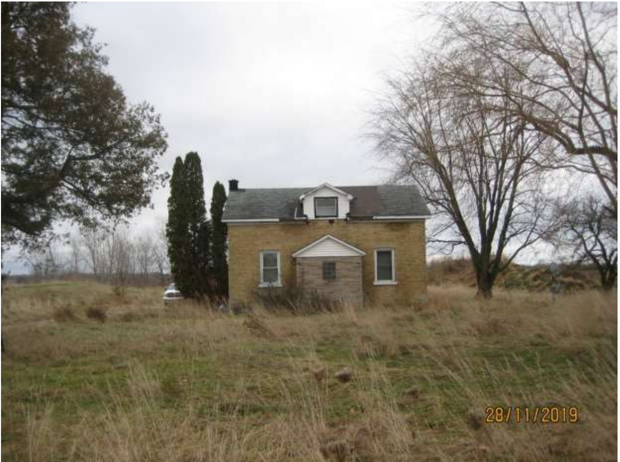
Image 2: Main (north) facade of the dwelling at 2325 Sunningdale Road East.