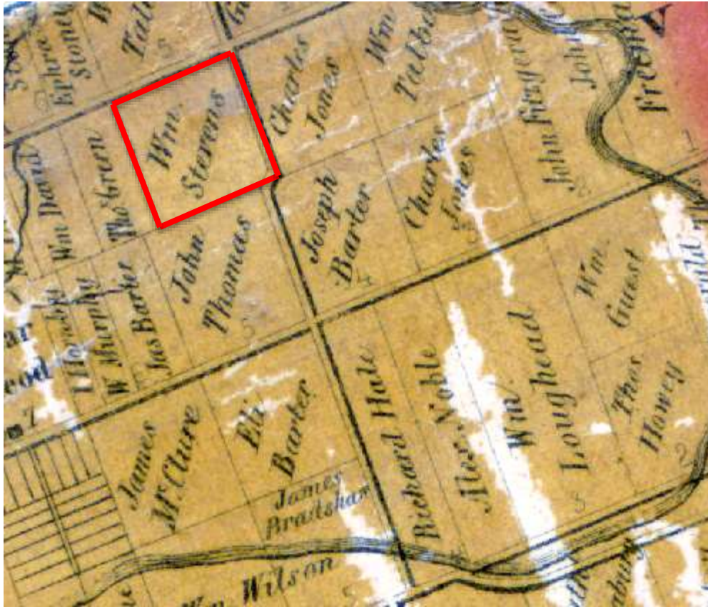
Figure 2: Extract from the Tremaine's Map of the County of Middlesex (1862), showing the north half of Lot 5, Concession V in the former London Township (red square). Wm. Stevens is noted as the occupant.