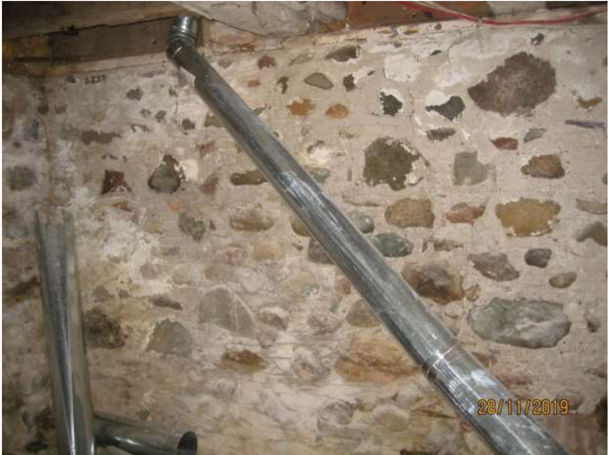
Image 14: Interior detail, showing the field stone foundation walls of the dwelling at 2325 Sunningdale Road East.