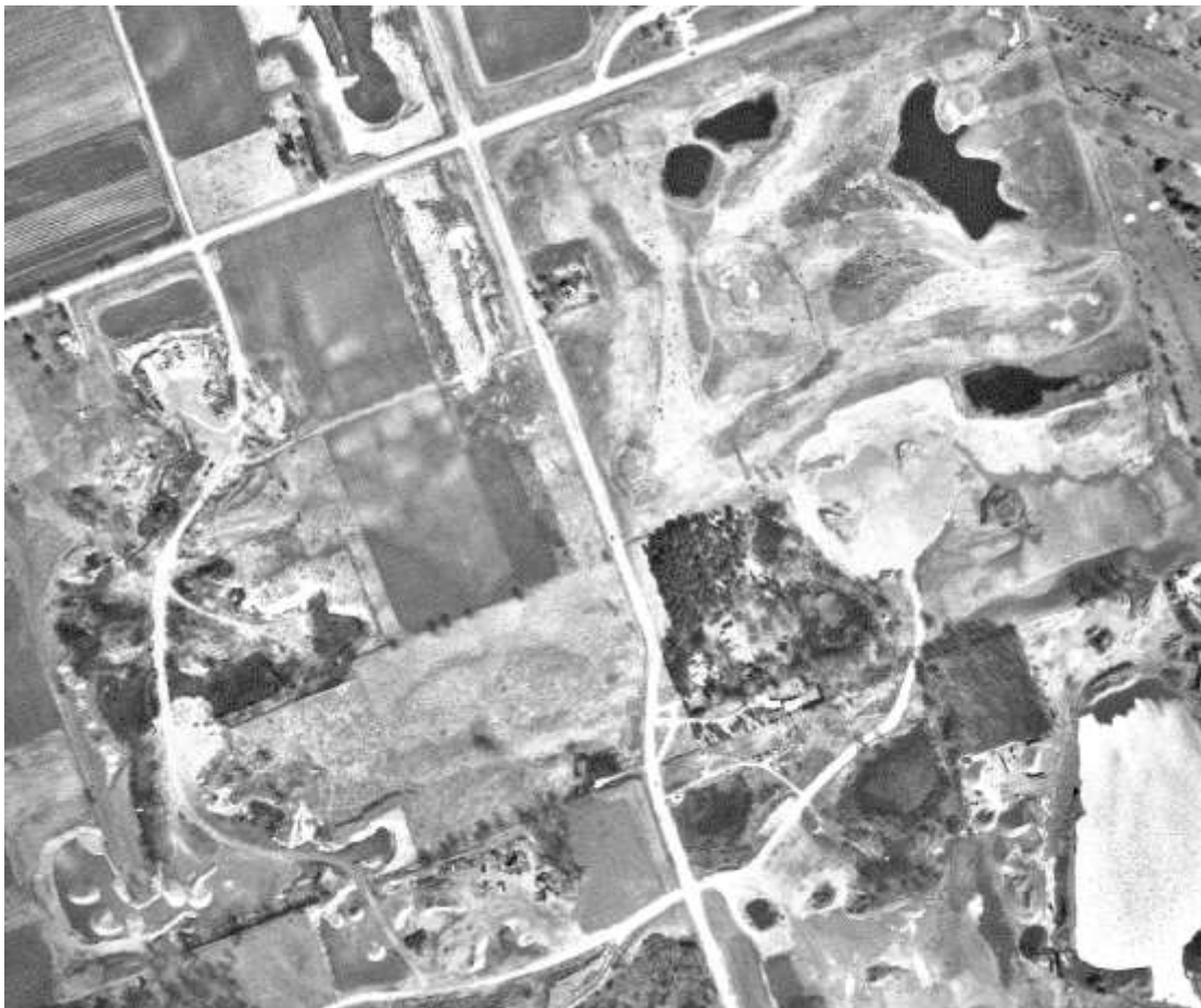
Figure 5: Extract from a 1993 aerial photograph showing the land use on the property transitioning to its current aggregate extraction use