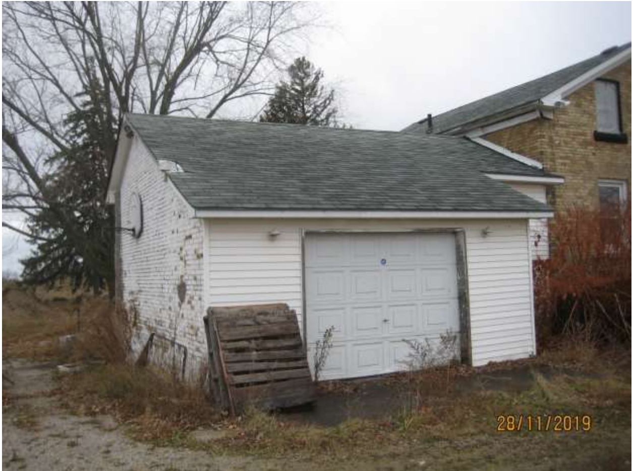
Image 5: Rear addition to the house at 2325 Sunningdale Road East. Note, a portion of the addition was likely used as an early summer kitchen, and a much large garage has also been added to the rear of the dwelling.