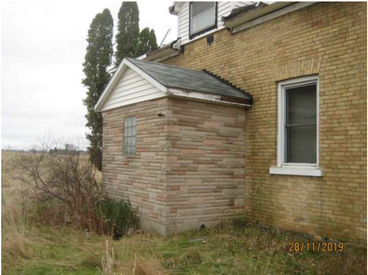
Image 8: View showing front addition on the house. The date of the addition is unclear, however, the exterior is clad with angelstone and vinyl siding.