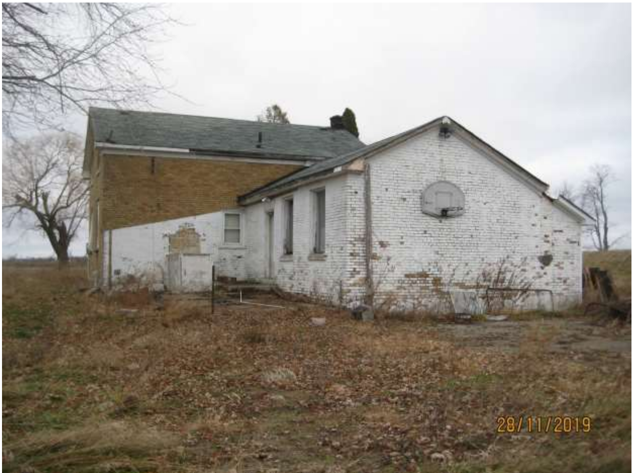
Image 4: Rear (south) facade of the dwelling at 2325 Sunningdale Road East showing main house and rear addition.