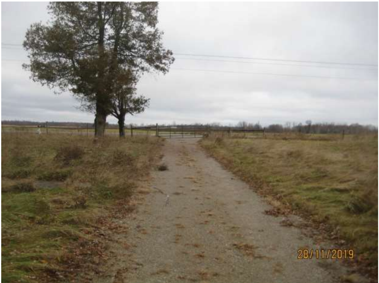
Image 6: View looking north showing the gravel laneway that provides access to the house from Sunningdale Road East