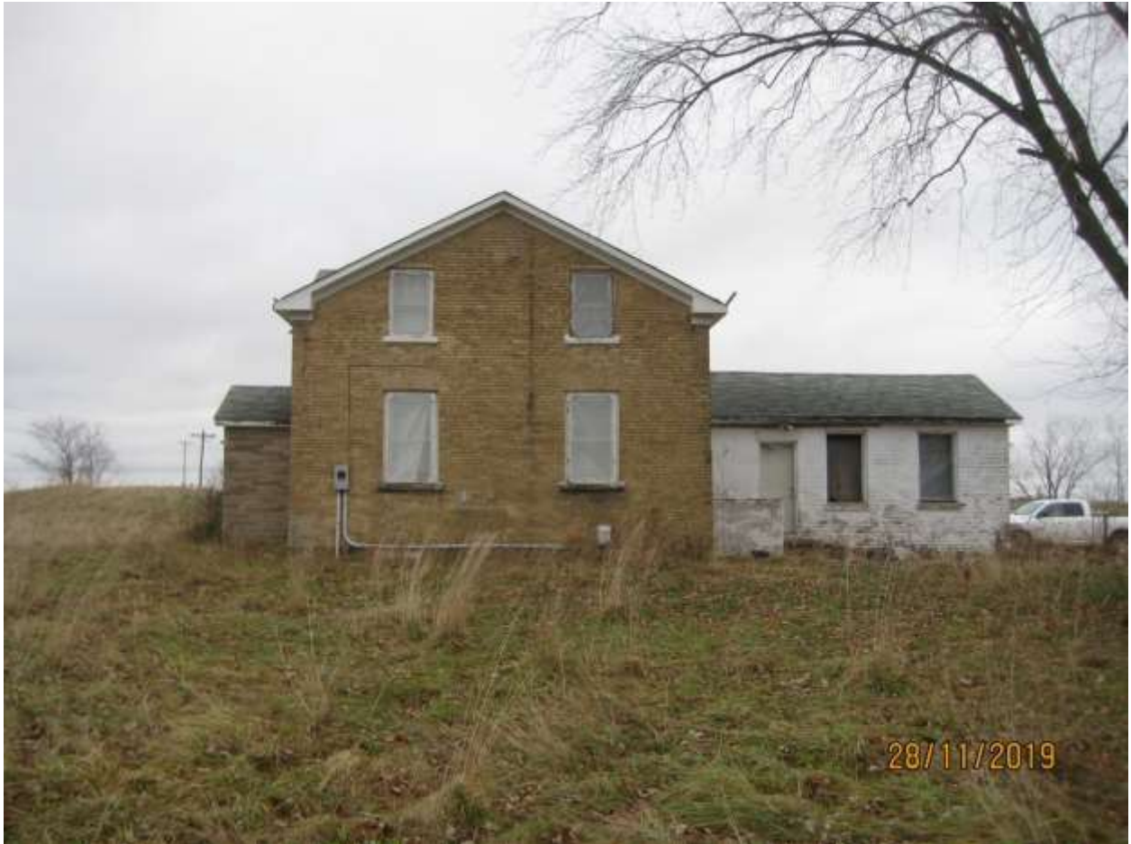
Image 3: West facade of the dwelling at 2325 Sunningdale Road East, showing the main house, front entrance at left, and rear addition at right.