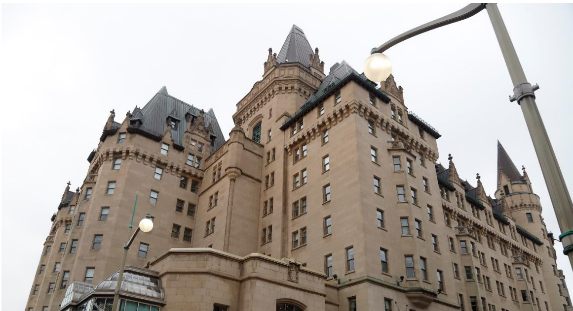
Chateau Laurier, Ottawa: site of FCM’s November board meeting