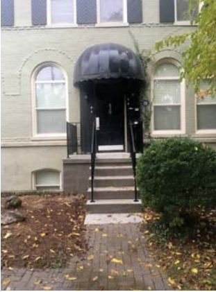
2019 - after