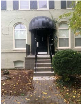
2019 - after