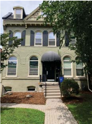
2019 - before