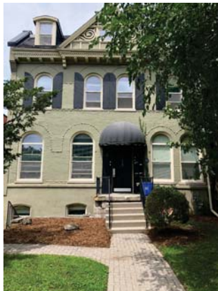
2019 - before