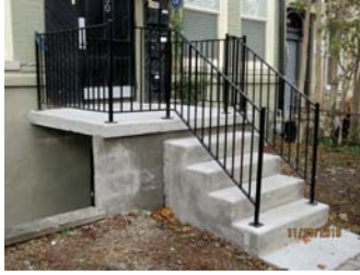
2019 - after