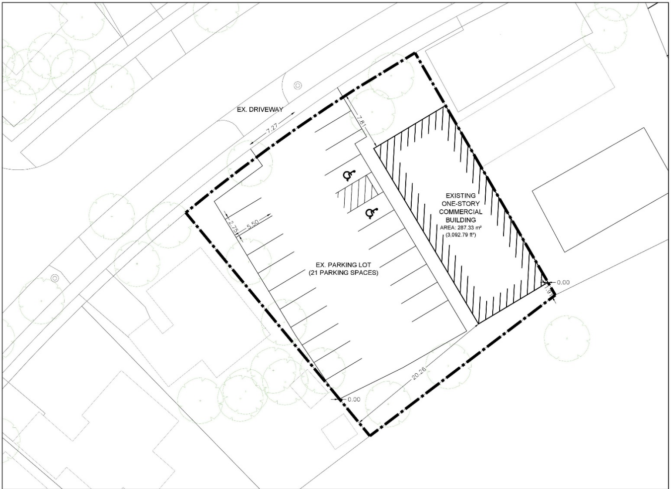
Existing Conditions Plan