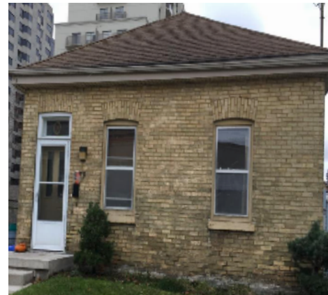
179 Ann St.