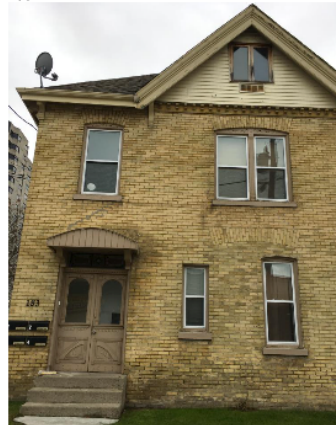
183 Ann St.