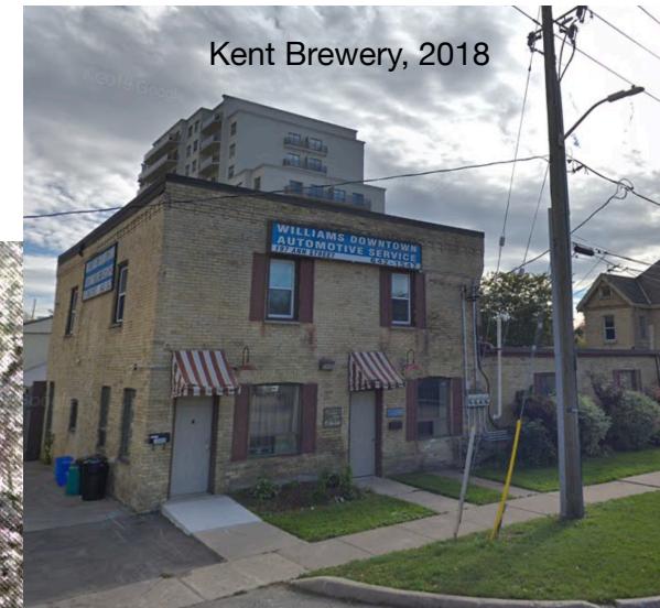
Kent Brewery, 2018