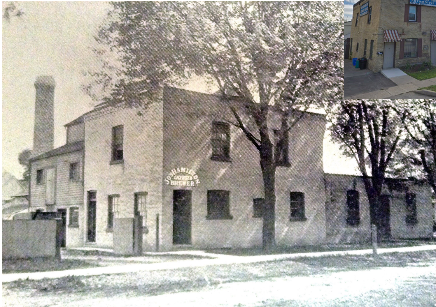
Kent Brewery, c. 1905