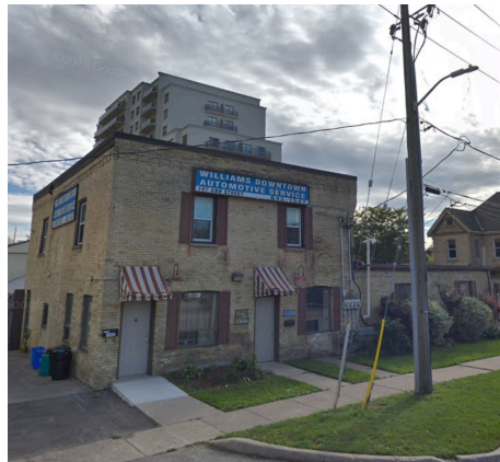
197 Ann St.