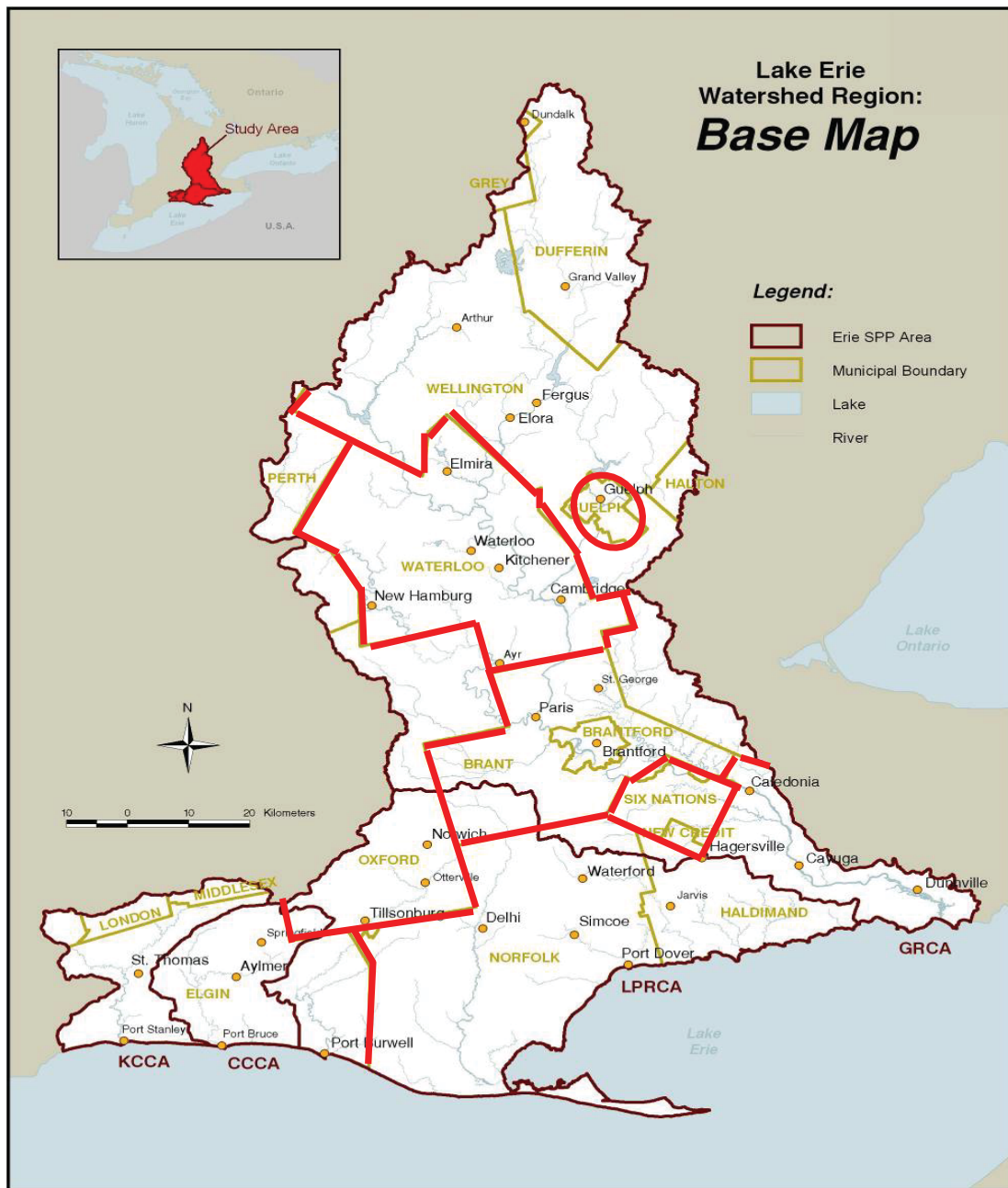
Map 1: Municipal Groups for the Selection of Source Protection Committee Representation