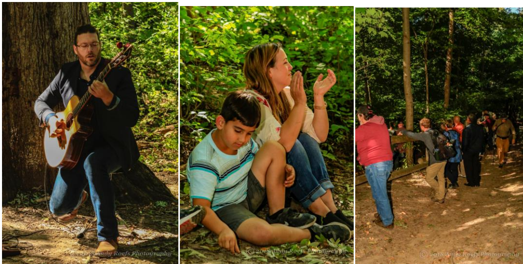
Photo taken from the 6 th Annual Emancipation Day Celebration. This is the ceremony around the Meeting Tree.