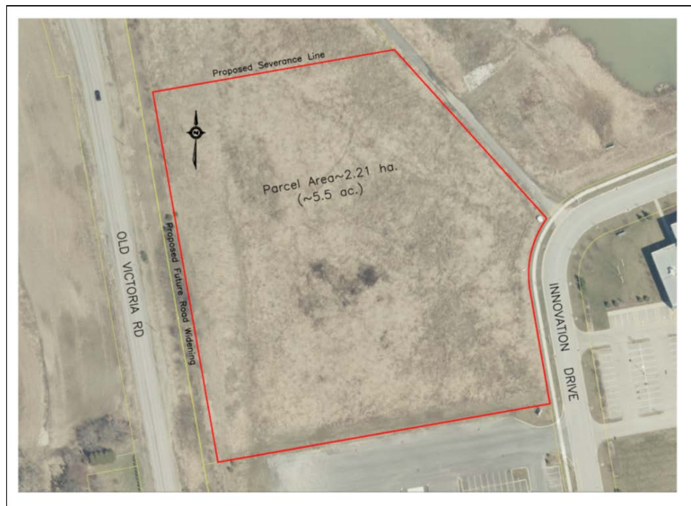
Subject To Final Survey