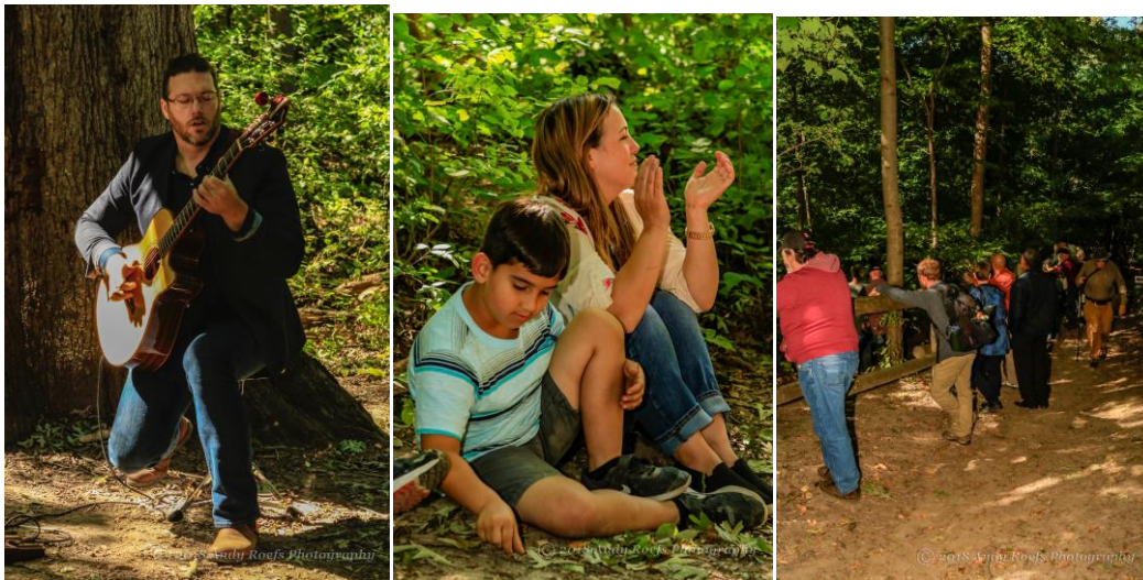
Photo taken from the 6 th Annual Emancipation Day Celebration. This is the ceremony around the Meeting Tree.