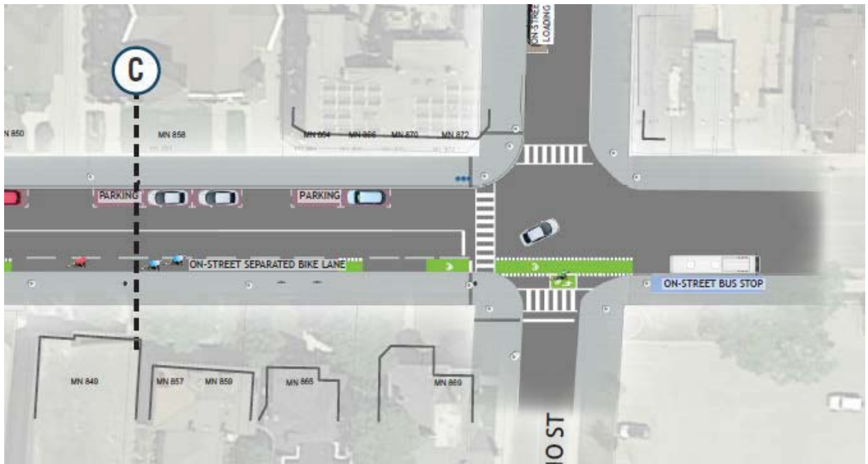
Figure 4: Dundas Street at Ontario Street