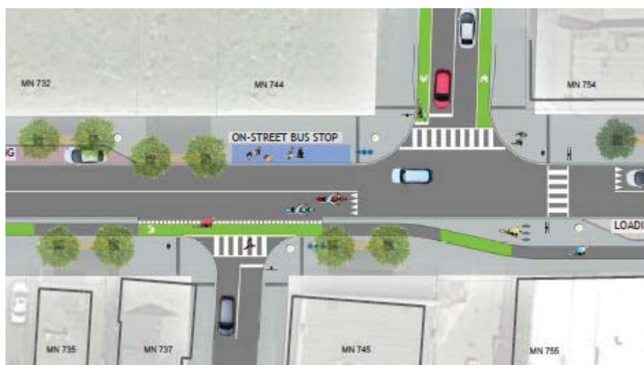
Figure 3: Dundas Street at Hewitt Street and English Street