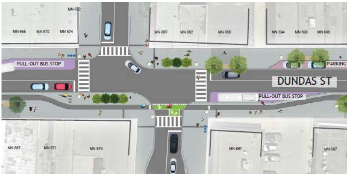
Figure 2: Dundas Street @ Elizabeth Street and Lyle Street