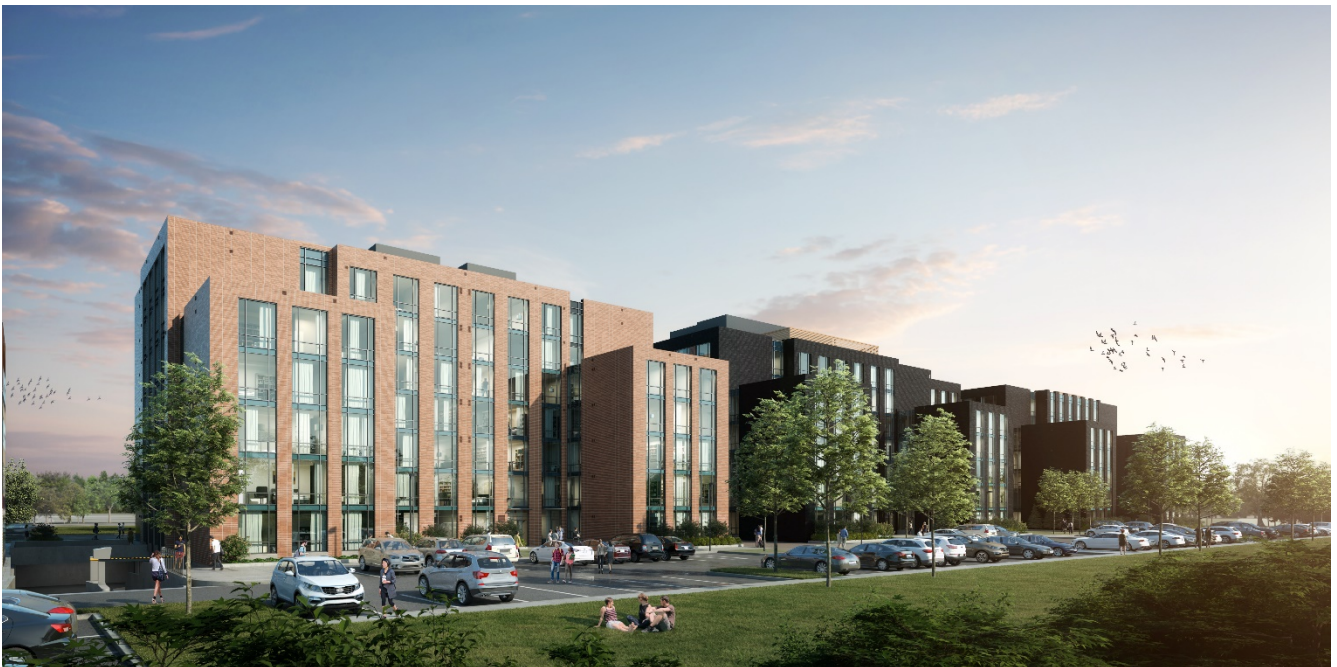
Conceptual Rendering – Rear View

The above images represent the applicant's proposal as submitted and may change.