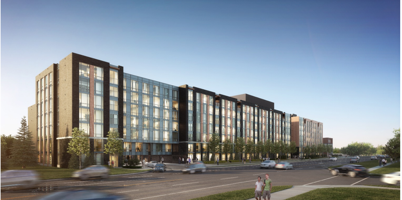
Conceptual Rendering – Richmond Street View