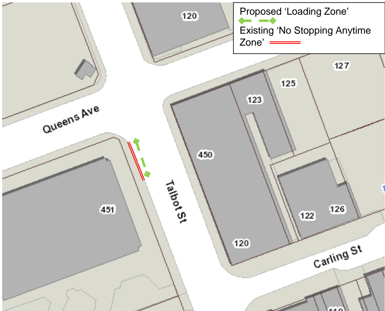
Figure 3: Talbot Street south of Queens Avenue

Amendments are required to Schedule 5 (Loading Zones) for the above changes.