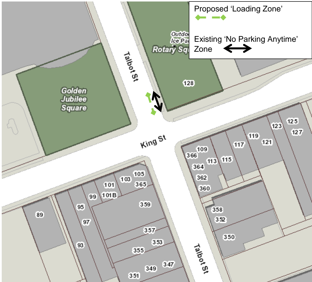
Figure 1: Talbot Street at King Street

The above results in the creation of three (3) loading zones without impacting the number of parking stalls. For clarity purposes existing parking regulations that remain unchanged are not shown in the following figures.