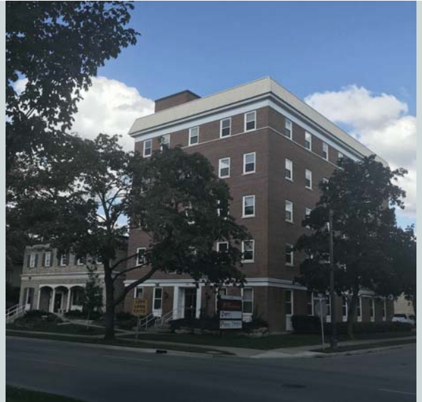
Upper Queens Park, Stratford