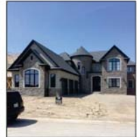
Three-bay garage (with bonus room)

Not permitted under proposed zoning requirements: