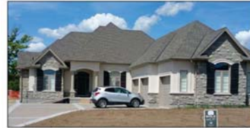
Three-bay garage (without bonus room)

Not permitted under proposed zoning requirements: