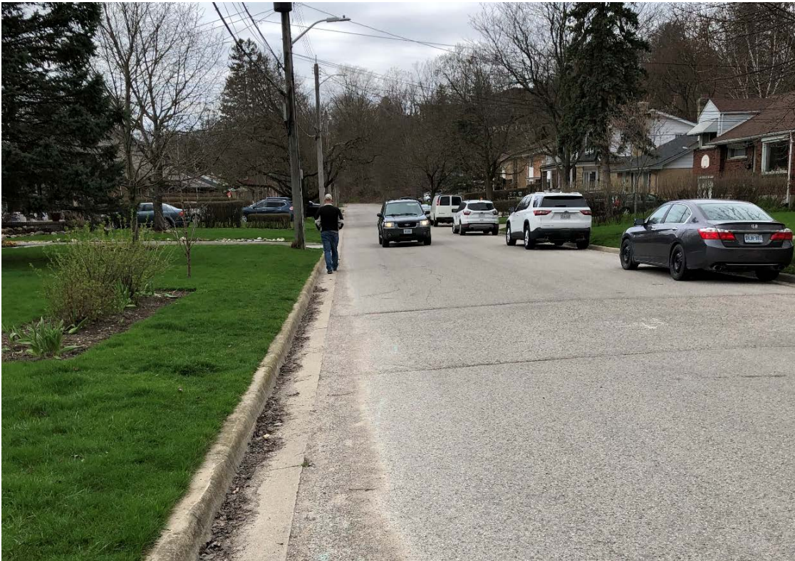
A typical Kensington Village street without sidewalk

The Kensington Village neighbourhood is within the Eagle Heights Public School catchment area, but students are not provided bussing. The lack of sidewalks pose a safety risk to pedestrians, especially during peak traffic times and winter months, when the shared roadway width is decreased due to the presence of parked vehicles or snowbanks. Sidewalks provide a comfortable and separated space for pedestrians, especially children, the elderly or pedestrians with mobility assistance devices.