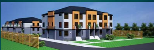
View from Fanshawe Park Rd E – looking south