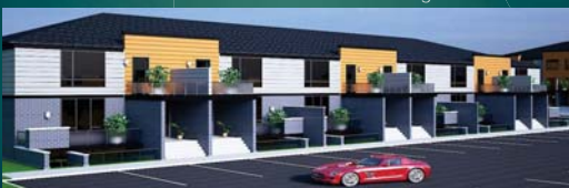
View of Building B from within site – looking west