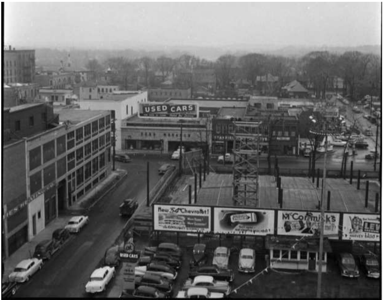
Image 4 – Photo of the front façade at 123 Queens Avenue looking west from Richmond.