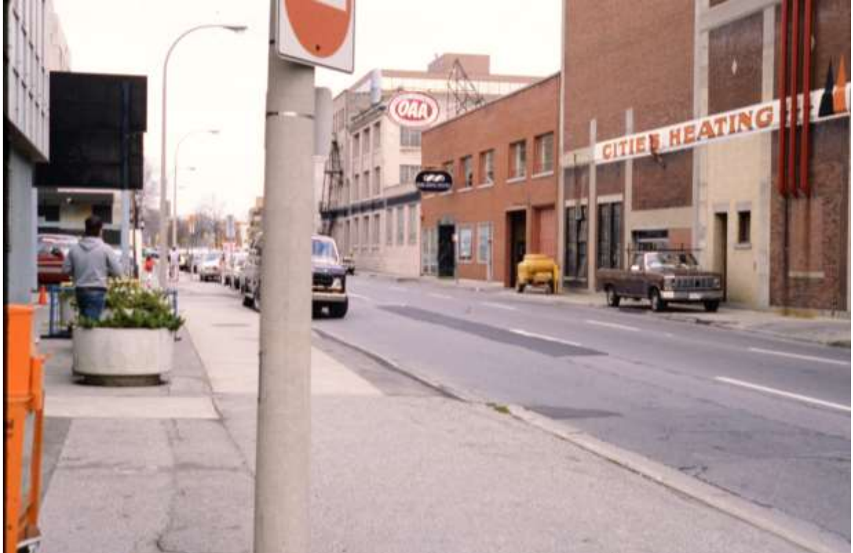
Image 5 – Photo of the south side of Queens Avenue looking east from Talbot Street. Photo taken prior to 1988. The photo shows the bricked in windows at 123 Queens Avenue, but also shows 3 pipes running into the building through the former openings. The exact date of the photo has not been confirmed, but an aerial from 1988 shows the lot located at 134 Carling Street as vacant, which dates the photo to prior 1988 as the photo shows a building on the property at 134 Carling Street. This means that the windows were bricked in at some point between 1955 and 1988.