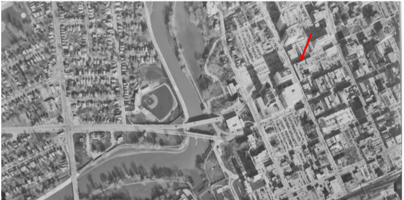
Image 7 – 1988 Aerial showing Queens Avenue and the vacant lot at 134 Carling Street. The property located at 123 Queens Avenue is shown by red arrow.