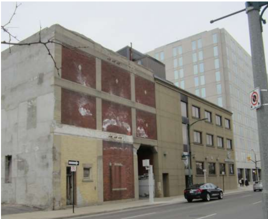
Image 2 – Photo of the front façade of the building located at 123 Queens Avenue (April 25, 2019)