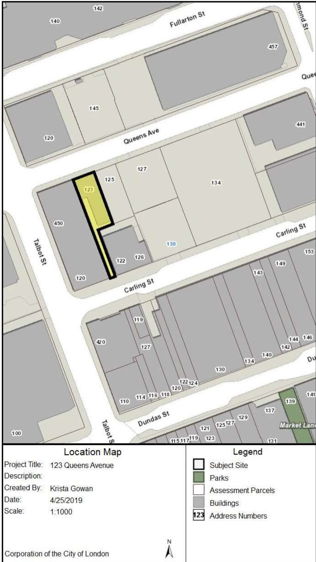
Figure 1: Location of the property at 123 Queens Avenue.