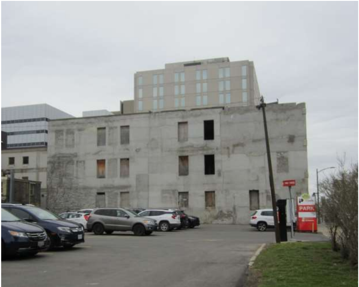
Image 3- Photo of the east façade of the building located at 123 Queens Avenue (April 25, 2019)