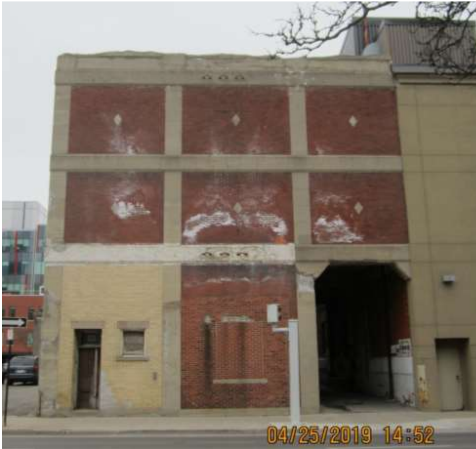
Image 1 – Photo of the front façade of the building located at 123 Queens Avenue (April 25, 2019)