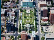
Central Memorial Park, Calgary