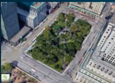
Dorchester Square, Montreal

Mix of modern and heritage; variation in height; density around the park; buildings frame the park