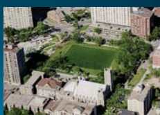
Central Park, Winnipeg