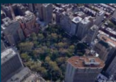
Rittenhouse Square, Philadelphia