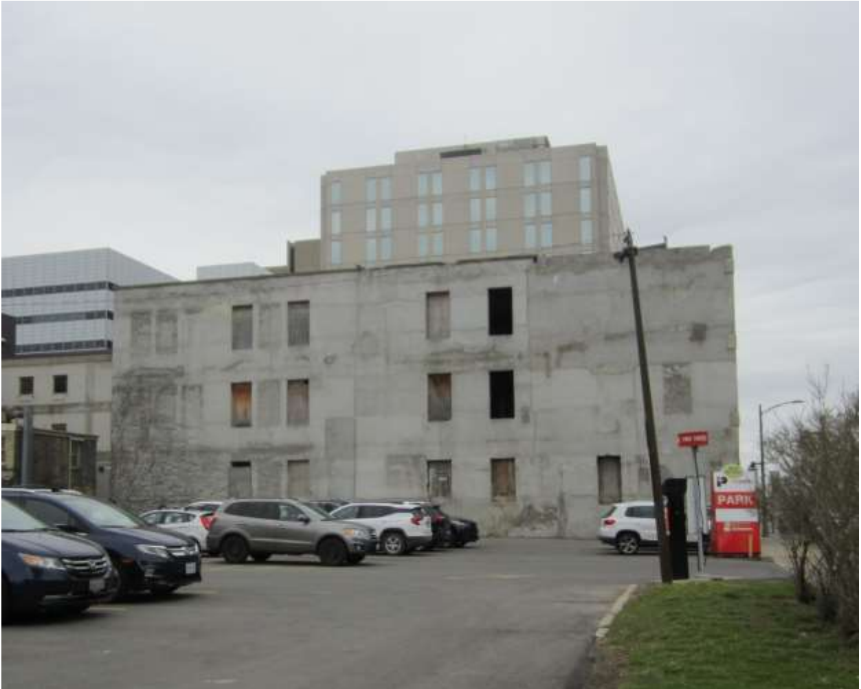
Image 3- Photo of the east façade of the building located at 123 Queens Avenue (April 25, 2019)