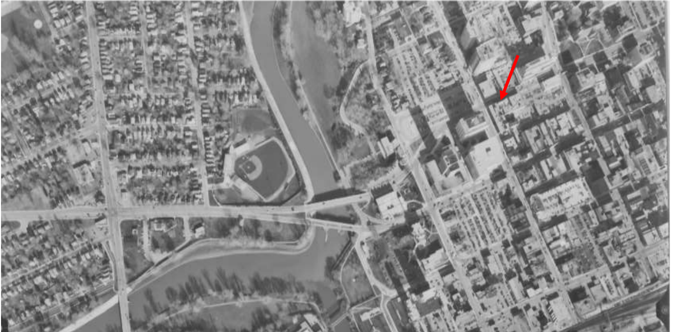
Image 7 – 1988 Aerial showing Queens Avenue and the vacant lot at 134 Carling Street. The property located at 123 Queens Avenue is shown by red arrow.