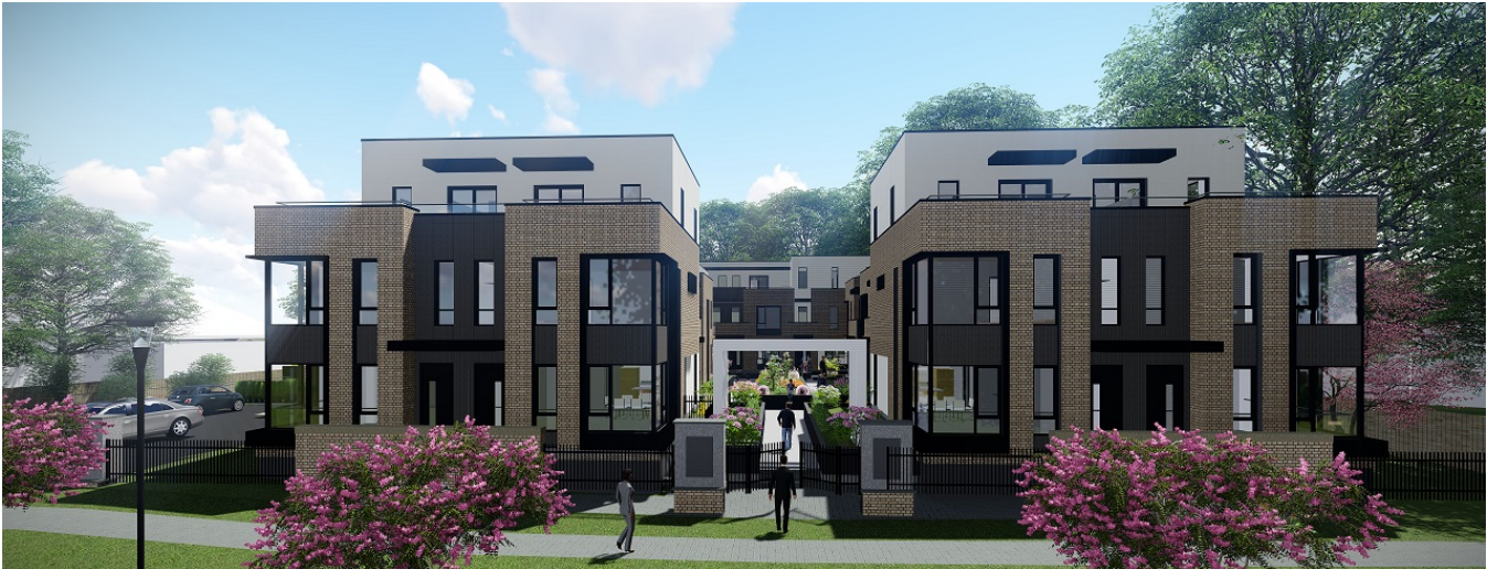
View from Wonderland Road North 1