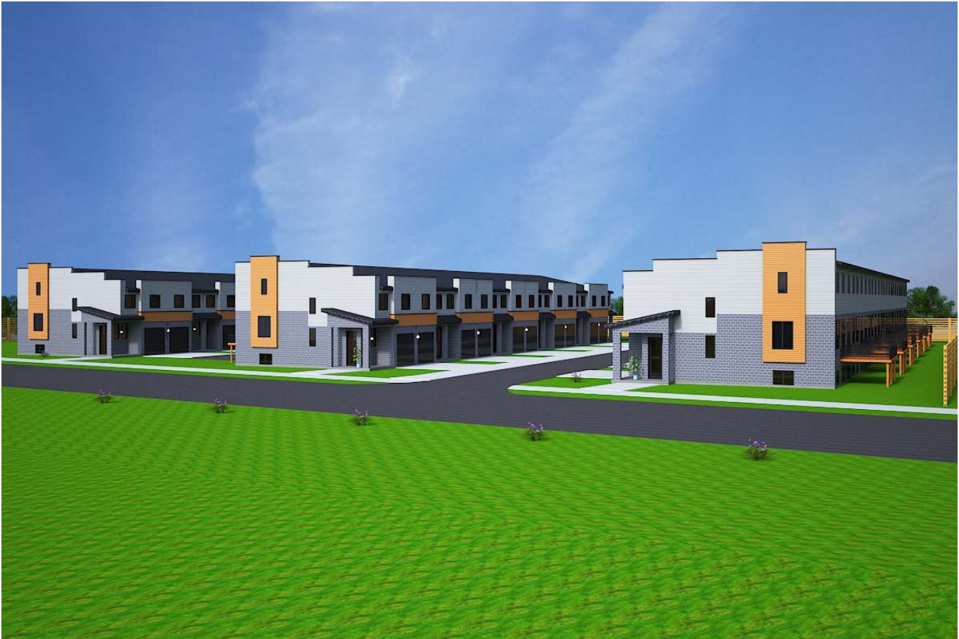
View from Colonel Talbot