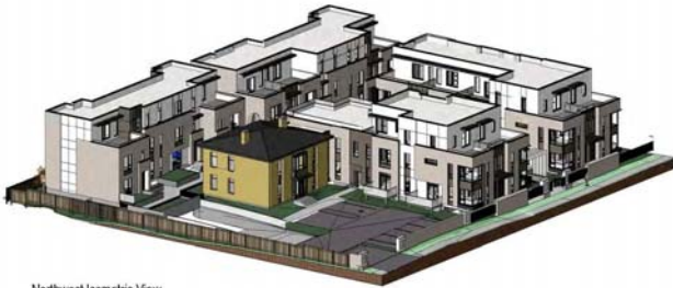
Northwest Isometric View