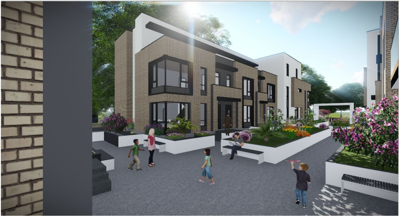
View of Interior Courtyard

The above images represent the applicant's proposal as submitted and may change.