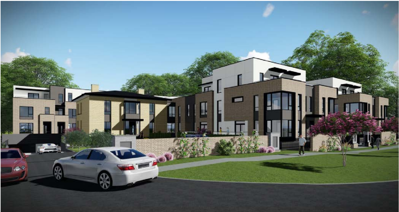
View from Richmond Street 2