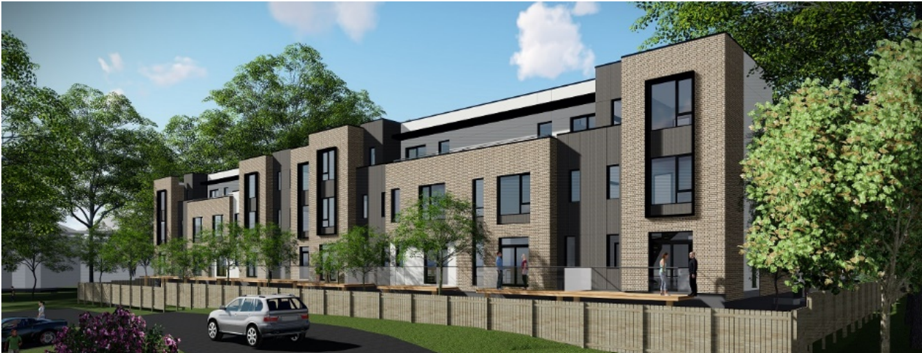
View from Interior of 2105 Wallingford Avenue Development

The above images represent the applicant’s proposal as submitted and may change.