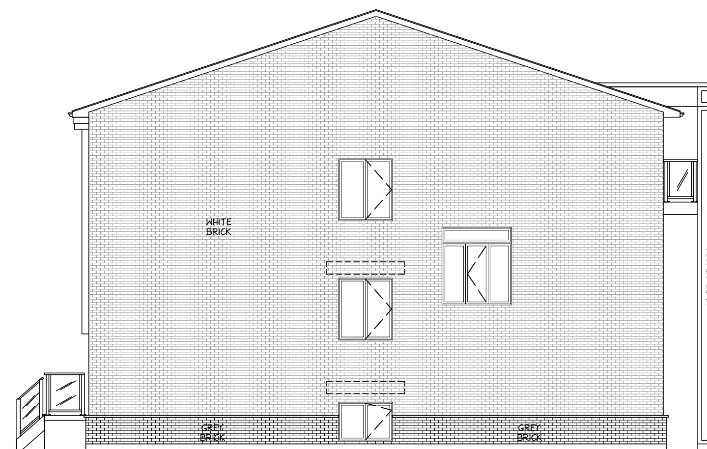
SIDE ELEVATION (OTHER SIDE MIRROR IMAGE)

CONTRACTOR SHALL CHECK ALL DIMENSIONS ON THE WORK AND REPORT ANY DISCREPANCY TO DESIGNER BEFORE PROCEEDING.