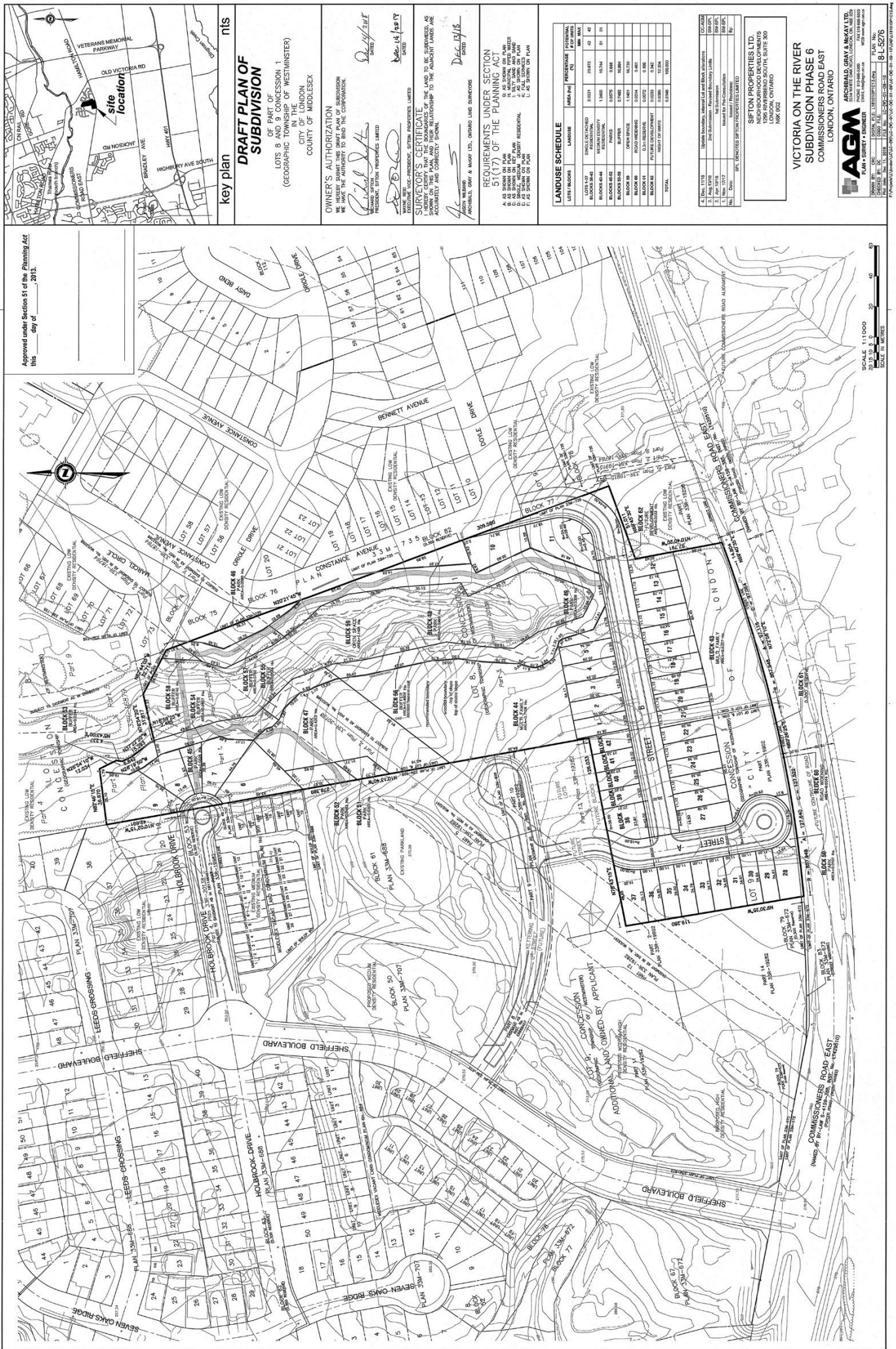
The above image represents the applicant's proposal as submitted and may change.