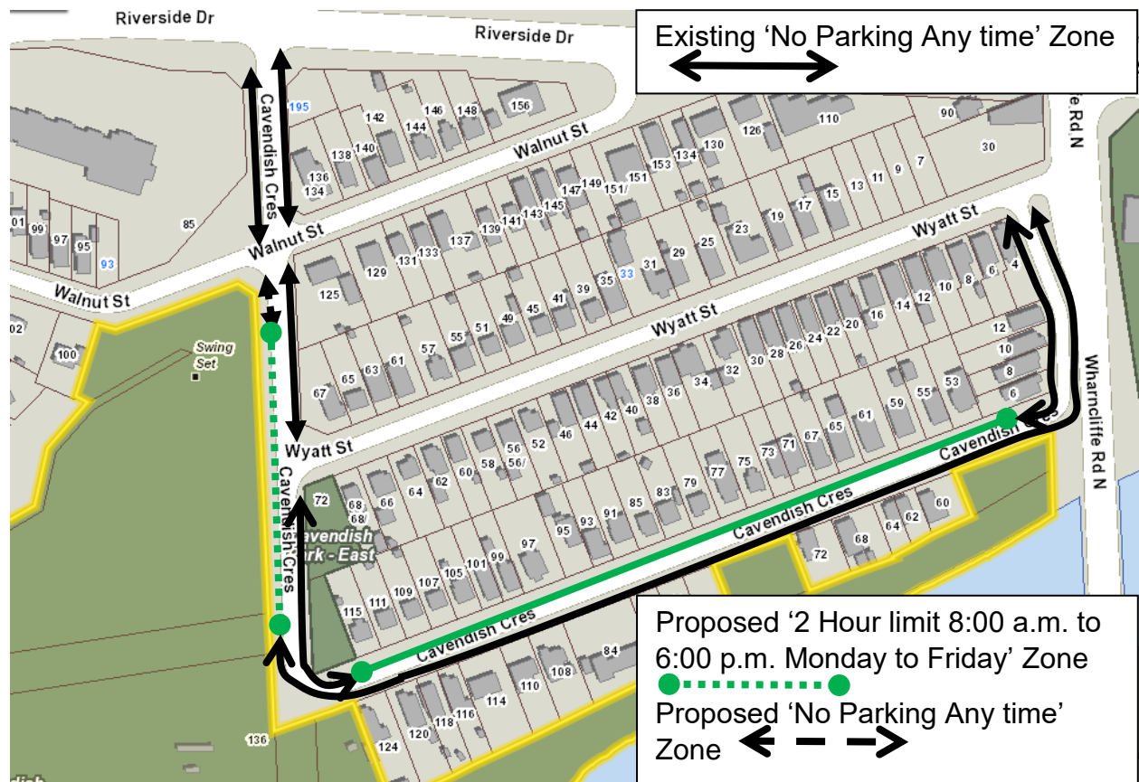
Figure 2: Cavendish Crescent Proposed Parking Regulations

Amendments are required to Schedule 2 (No Parking) and Schedule 6 (Limited Parking) to address the above changes.