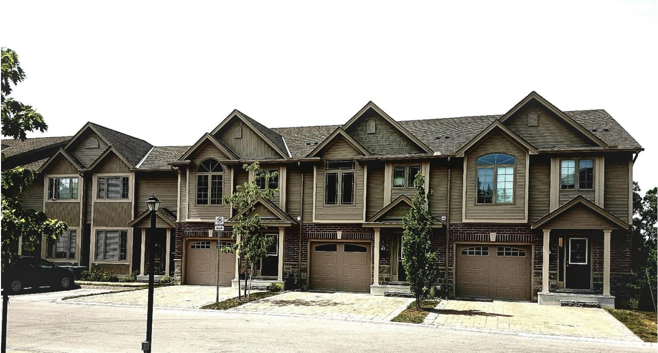
Proposed Townhouse Concept

The above images represent the applicant's proposal as submitted and may change.