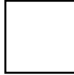
Figure 1 – Third Street – Between Oxford Street East and Cheapside Street