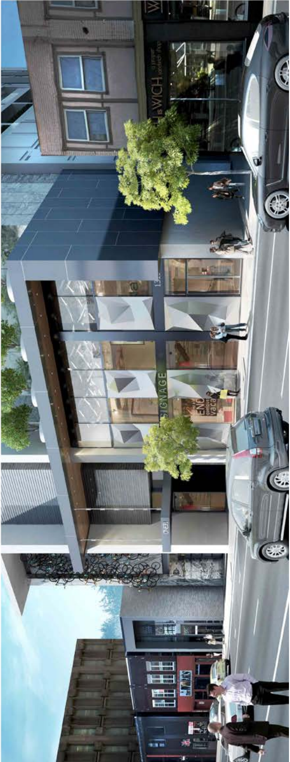
The above images represent the applicant's proposal as submitted and may change.