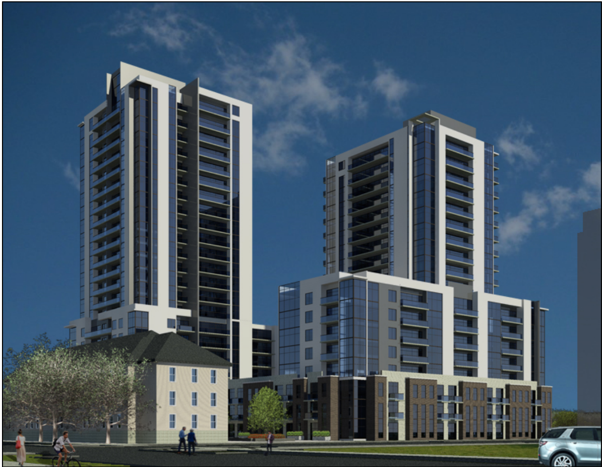
View from Northeast