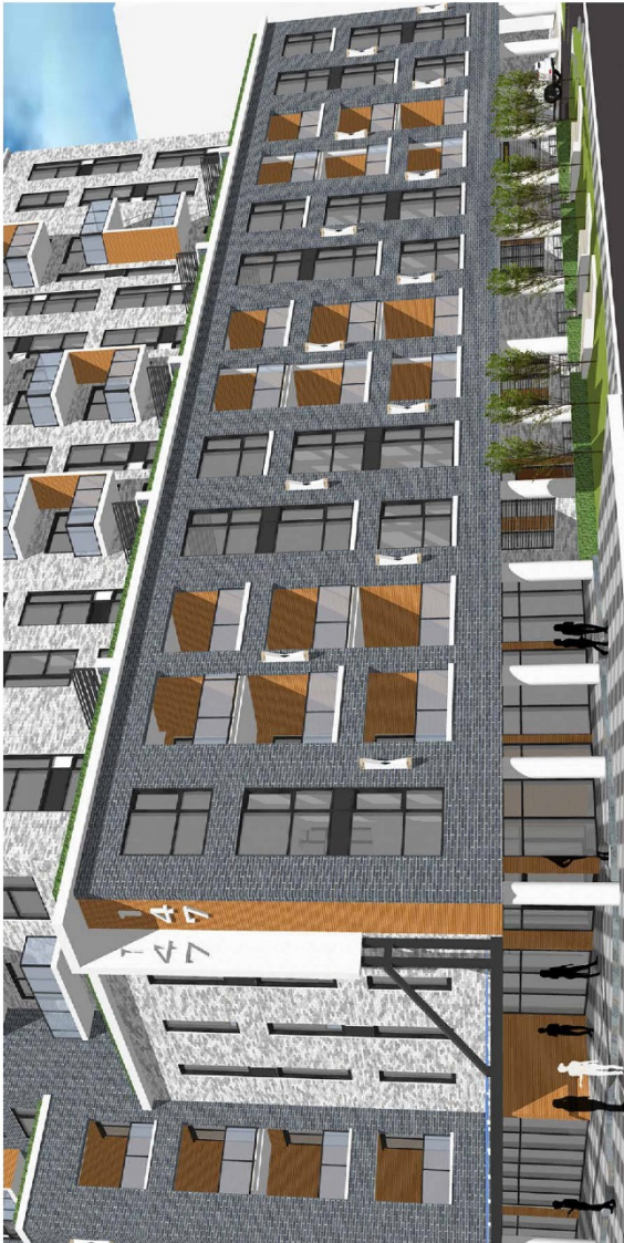
The above images represent the applicant's proposal as submitted and may change.