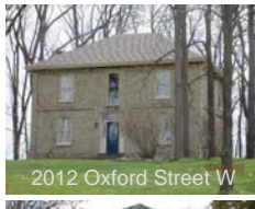
2012 Oxford Street W