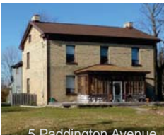
5 Paddington Avenue