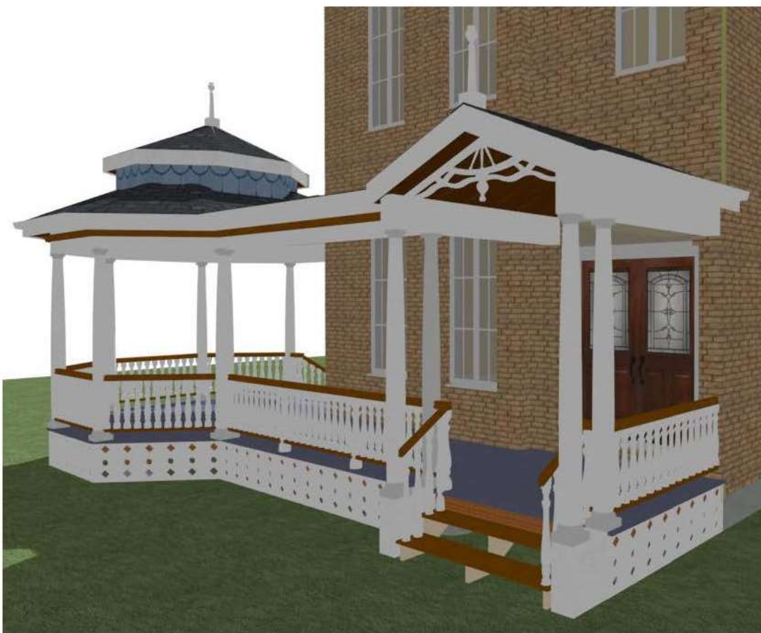
Figure 7: Architectural rendering of new porch expansion (north-east view)