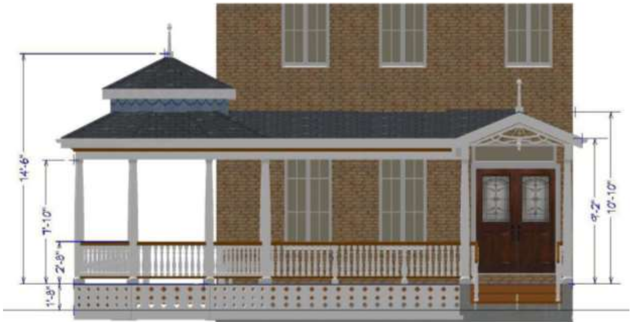
Figure 4: Architectural rendering of elevation of new porch (north façade)