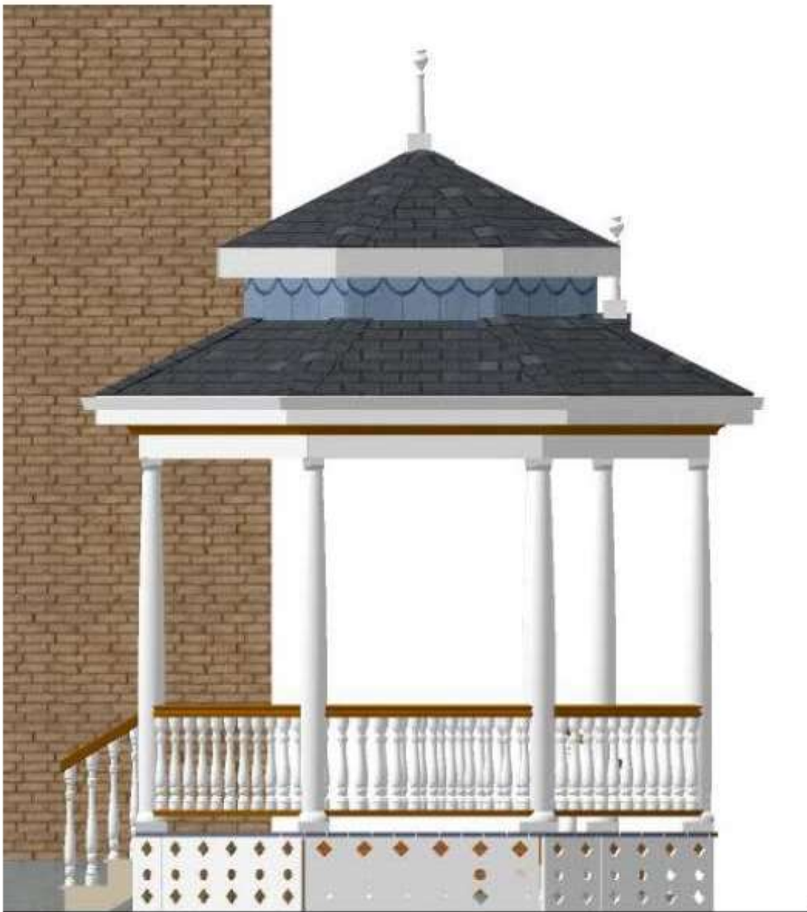
Figure 5: Architectural rendering of corner feature of new porch (west view)