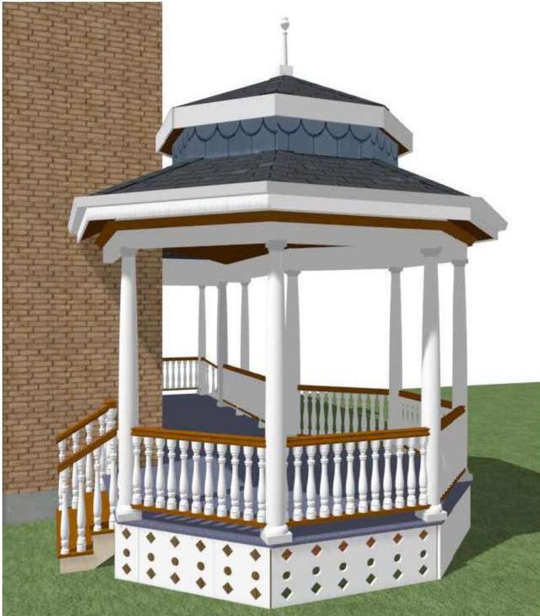
Figure 6: Architectural rendering of corner feature of new porch (west view)