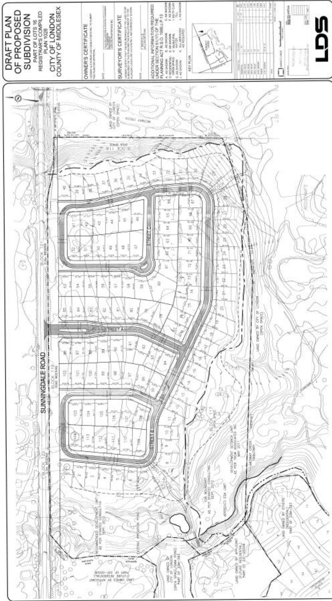
The above image represents the applicant's proposal as submitted and may change.