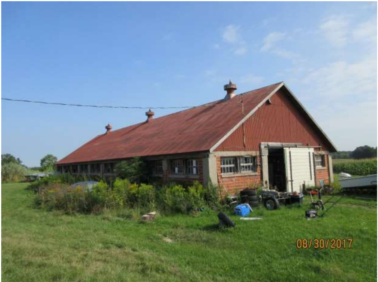
Image 1: View of Barn 2 located at 660 Sunningdale Road East looking northeast. Barn 2 has three ventilators along the ridge of its roof.