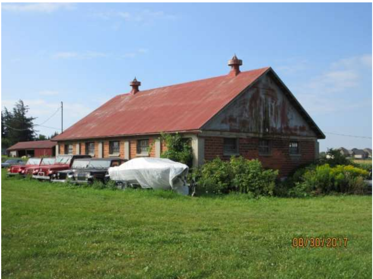
Image 2: View of Barn 3 located at 660 Sunningdale Road East looking southwest. Barn 3 has two ventilators along the ridge of its roof.