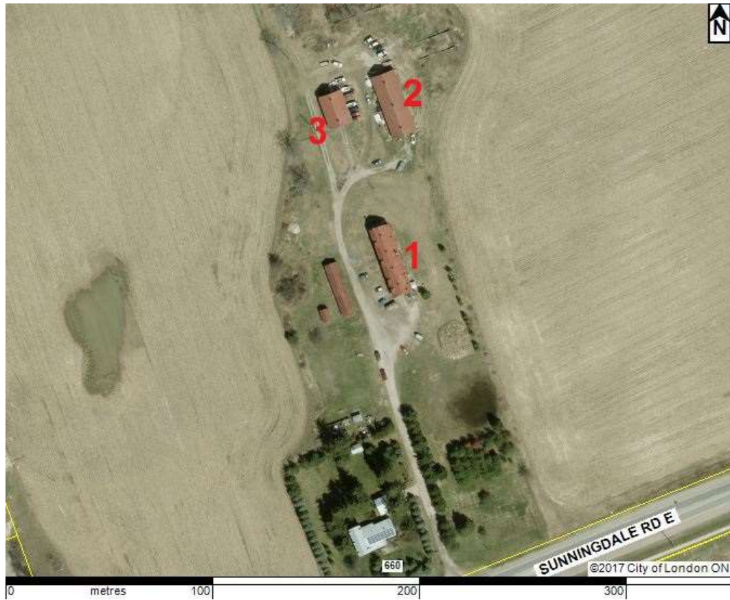
Figure 2: Detail of the property located at 660 Sunningdale Road East identifying Barn 1, Barn 2, and Barn 3. Note: Barn 1 has been demolished.